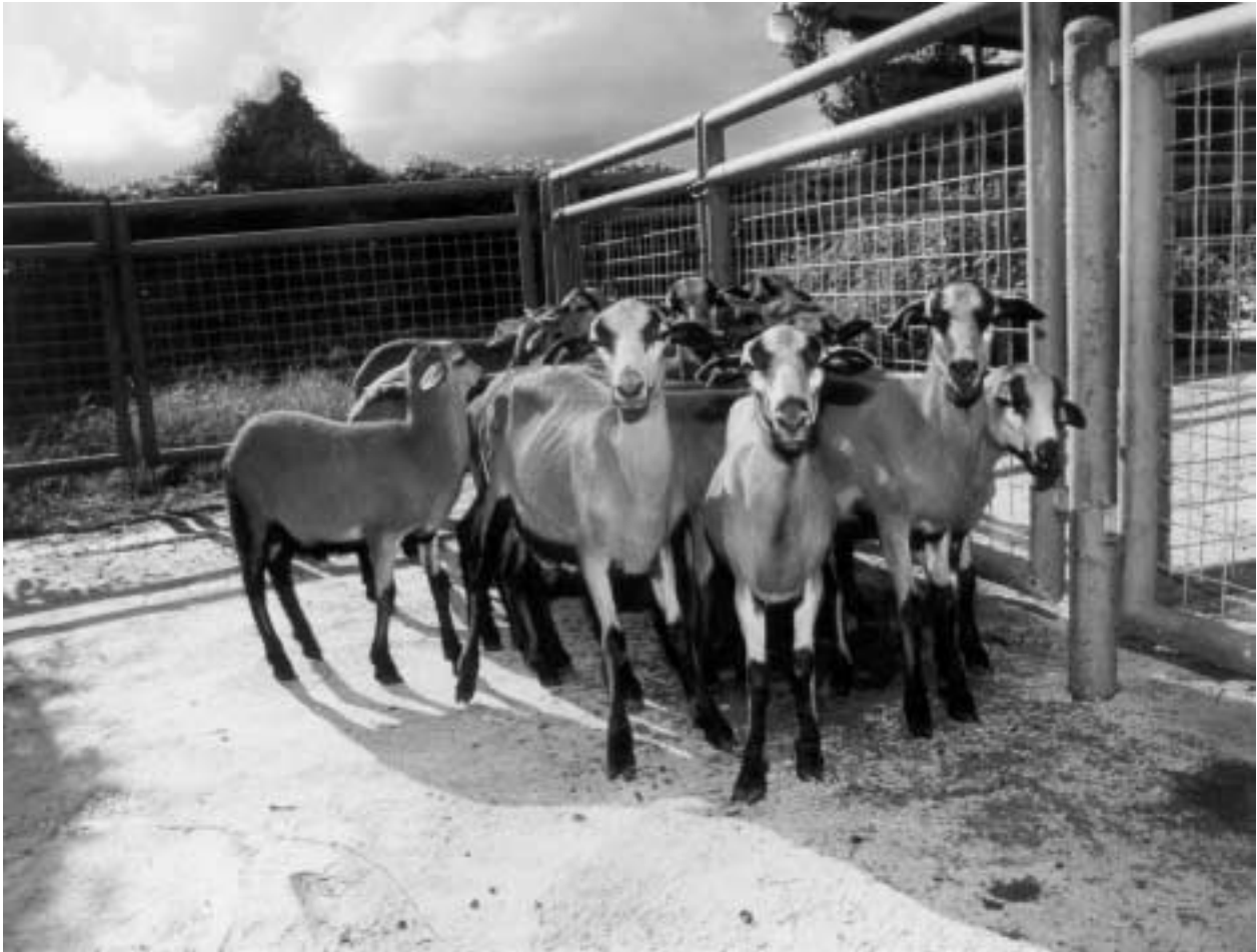
Plate: 5 Barbados black belly sheep

the genetic base of the breed is improved by selecting female and male lambs based on their performance during a 120-day observation period starting directly after birth. The only Government owned farm rearing the black belly sheep is the Greenland Agricultural Livestock Research Station in Greenland, St. Andrew, which is under the MAR. However there are many private farms and privately owned sheep scattered throughout Barbados. Presently the MAR is in the process of patenting the DNA profile of the Barbados black belly sheep.