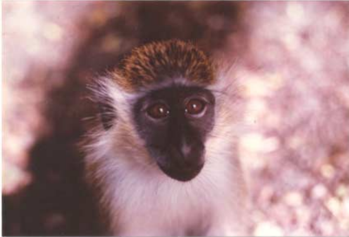
Plate: 7 The green monkey ( Cercopithecus aethiops sabaesus )