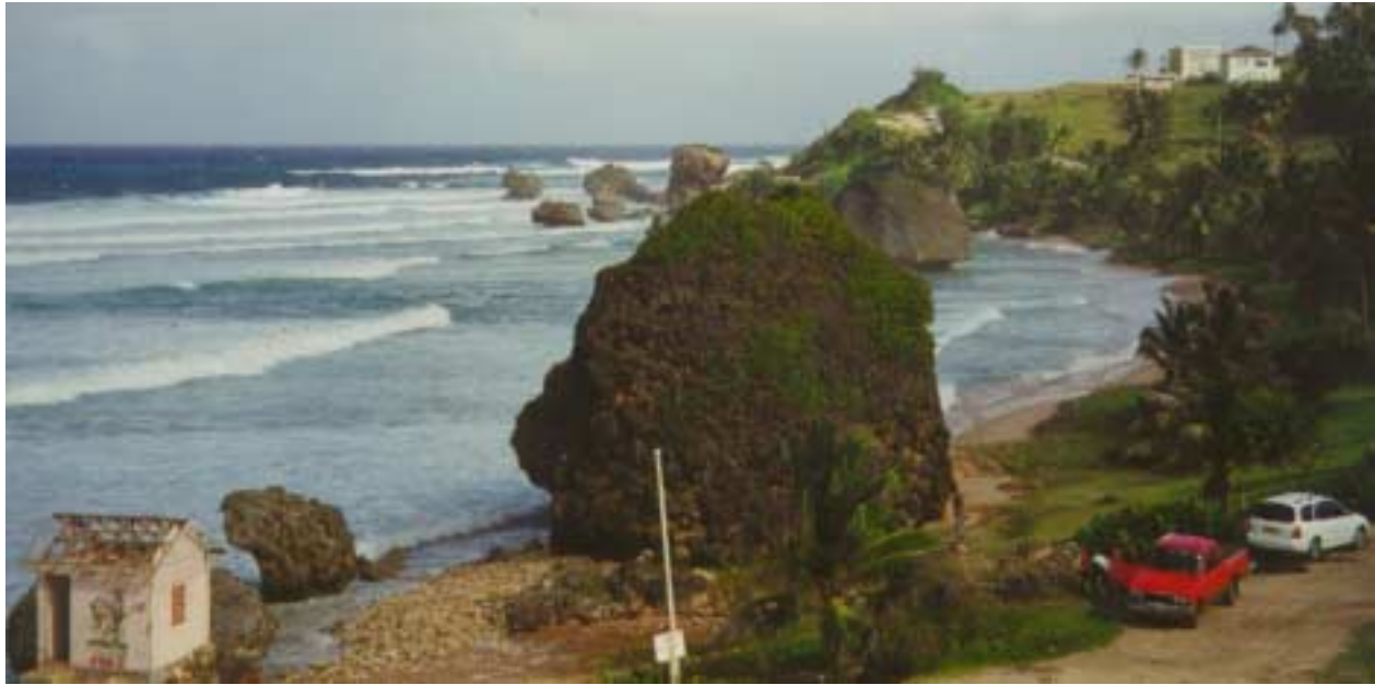
Plate: 10 A tidepool site at Bathsheba, East Coast