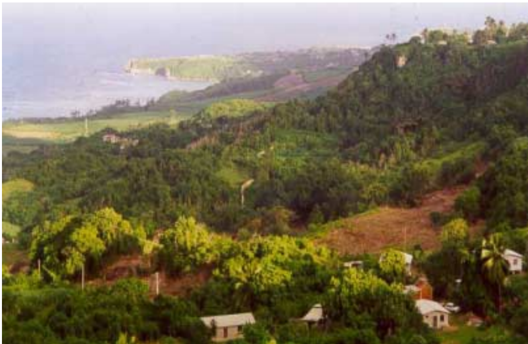
Plate: 14 A section of the National Park Area with East Coast in the background

Within the National Park Area only activities related to agriculture, conservation, forestry, passive recreation and facilities related to the National Park will be permitted. The NPDP details a set of policies to guide land use in this area.