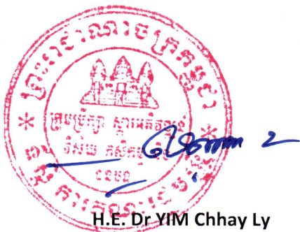
H.E. Dr YIM Chhay Ly Deputy Prime Minister Chairman of the Council for Agricultural and Rural Development and Chairman of the Technical Working Group for Food Security and Nutrition