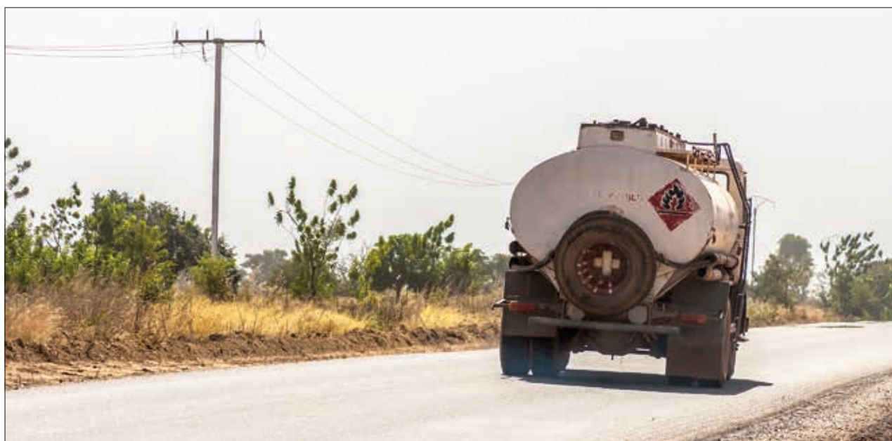
Fuel Truck, State Road 1, Burkina Faso

In the area of Railways, the ECOWAS Region had in the last decade a total rail network of approximately 10,188km, now counts today for 8,052km. Like the road sub-sector, the density of the rail network estimated at 1.9 km/1000 km 2 relatively low, compared to the continental average of 2.5 km/1000 km 2 is relatively low. Intra-Community flights and between ECOWAS and the rest of the continent are insufficient with ticket costs among the highest on the continent. In addition, despite the opportunities in the maritime transport (including seaports) sub-sector which carry almost 95% of freight between the region and international markets, the assessment of this sub-sector indicated that there are still challenges to be addressed, notably in terms of capacity of port infrastructure, as well as efficiency of operations and port clearing processes. Over the past decade, there has been expansion in the ICT sector with an increase from 28% to 47% in 2018 in mobile phone penetration, the highest rate among the RECs. In contrast, internet access is still limited with an estimated penetration rate of 26% in 2018 but projected to increase in subsequent years due to mobile internet subscription. The mobile economy has the potential to transform the lives of millions of people in the region if properly harnessed.