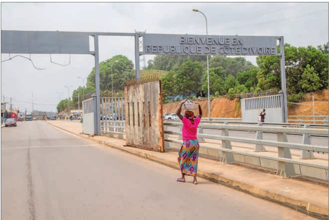
Female Trader crossing the border

58. An accelerating economic, monetary and trade integration: Since the mid-1970s there has been a dynamic process of regional integration in all aspects of development. An important aspect of this process has been the gradual consolidation of the regional market which has resulted in an increase in intra-Community trade, albeit at a low level compared to other regional cooperation arrangements. In 2019, intra-regional trade was up by 12% representing intra- regional exports and imports of 15% and 9% respectively. These figures do not take into consideration the unrecorded small-scale cross border trade. Nevertheless, this performance shows that there is still room for improvement in terms of trade integration. To accelerate regional integration, there's a need to remove all regulatory constraints, develop the required infrastructure for production and to facilitate the free movement of people and goods. The creation of the single currency, the ECO, through the achievement of economic and monetary Union, for which the region's political commitment remains unwavering, should also be a key accelerator for regional trade.