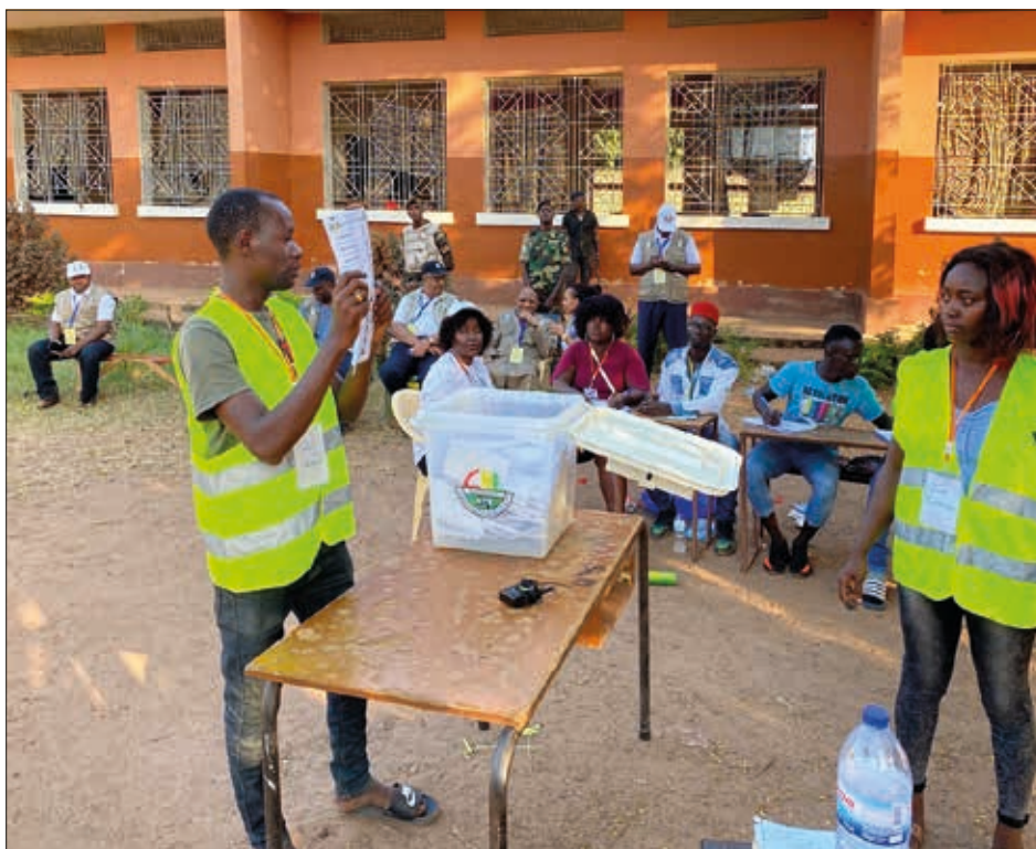
ECOWAS Election Observation Mission in 2019, Guinea-Bissau