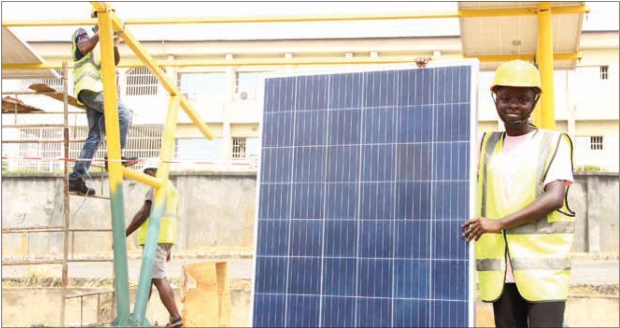
Construction of Solar Photovoltaic Carport at University of Ibadan