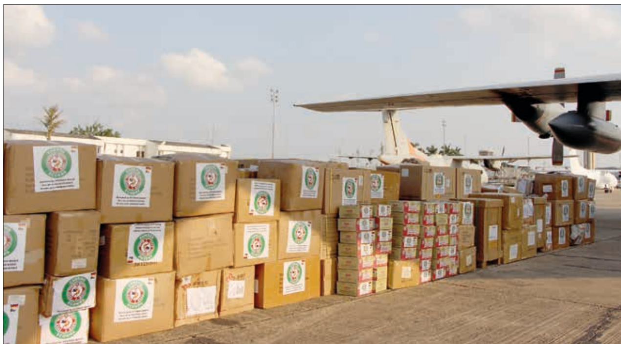
ECOWAS-WAHO COVID-19 medical equipment's for distribution to ECOWAS Member States, Nigeria, Abuja