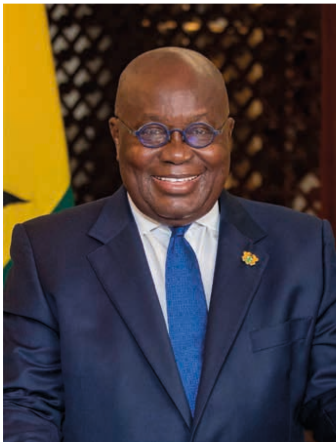
H.E. Nana Addo Dankwa AKUFO-ADDO President of the Republic of Ghana and Chairman of the ECOWAS Authority of Heads of State and Government