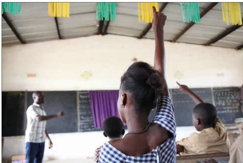
Large youthful population which should be considered an opportunity, Côte d'Ivoire, © GIZ/Gaël Gellé