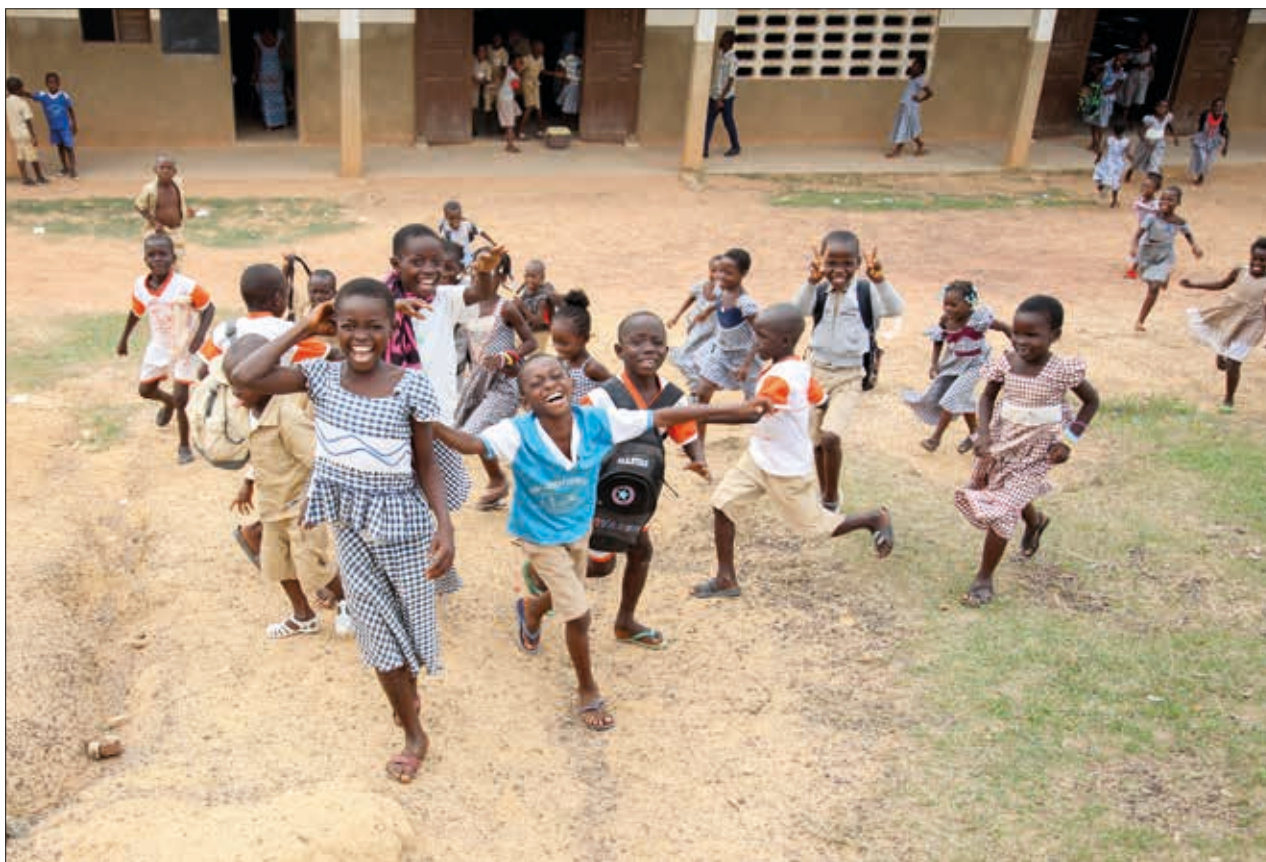
Children are the future of our society, Côte d'Ivoire, © GIZ / Gaël Gellé

Africa in 2015. The national health systems of Member States remain fragile, with low resilience to tropical diseases and health shocks (Ebola and COVID-19, for instance). Despite the efforts of the West African Health Organisation (WAHO), challenges relating to the availability of infrastructure, the quantity and quality of medical staff and the governance of health systems remain.