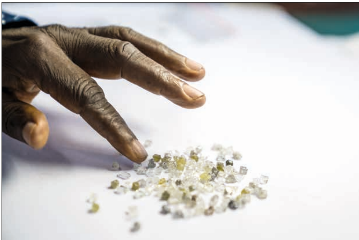
Raw materials and development of small-scale mining (diamonds) in Kono, Sierra Leone, © GIZ Michael Duff, Regional Resource Governance Programme (co-funded by EU and BMZ)

others), as well as agricultural raw materials (basic food items, including fruits and vegetables and cash crops such as cocoa, groundnut, cashew, coffee, cotton, rubber and wood).