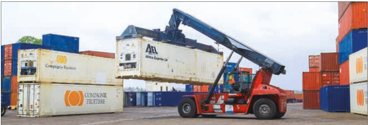
Exports becoming one of the key drivers of economic growth in the ECOWAS Region, Nigeria