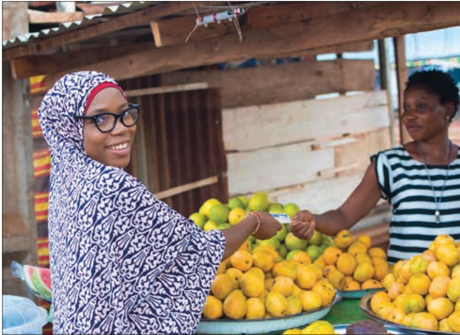
Recognise the special role of women as actors, agents, and beneficiaries of development