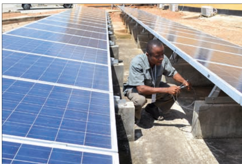
Training of Trainers on Solar Photovoltaic and Mini-Grid Design