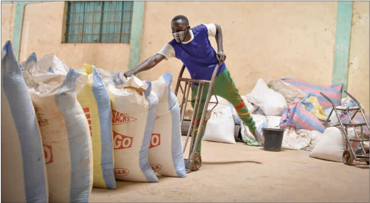
Alliance Sahel, Promoting Sustainable Agriculture, Burkina Faso