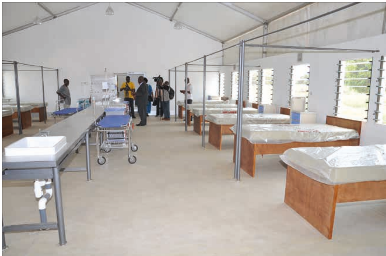
Beds ward / treatment centre in Tema, Ghana