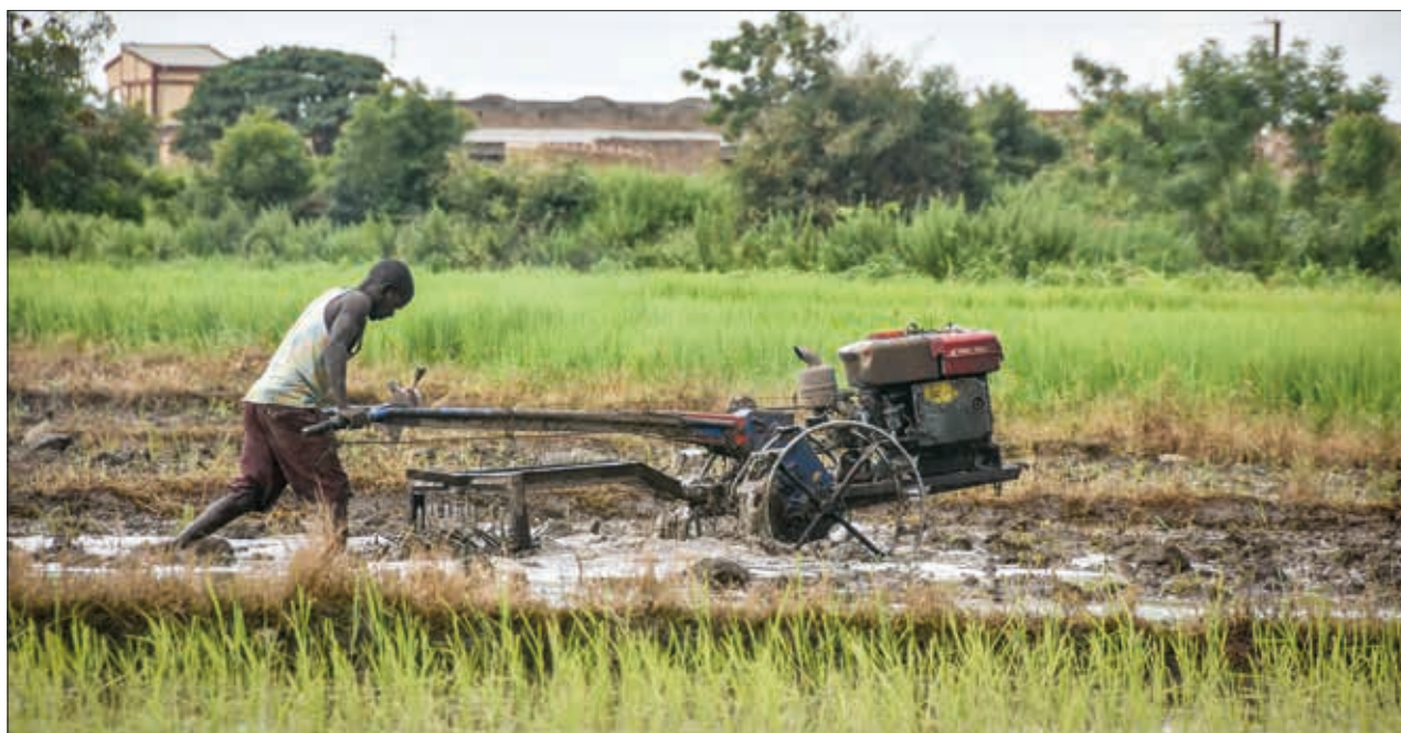
Alliance Sahel, Promouvoir une agriculture durable, Burkina Faso, © GIZ / Aude Rossignol