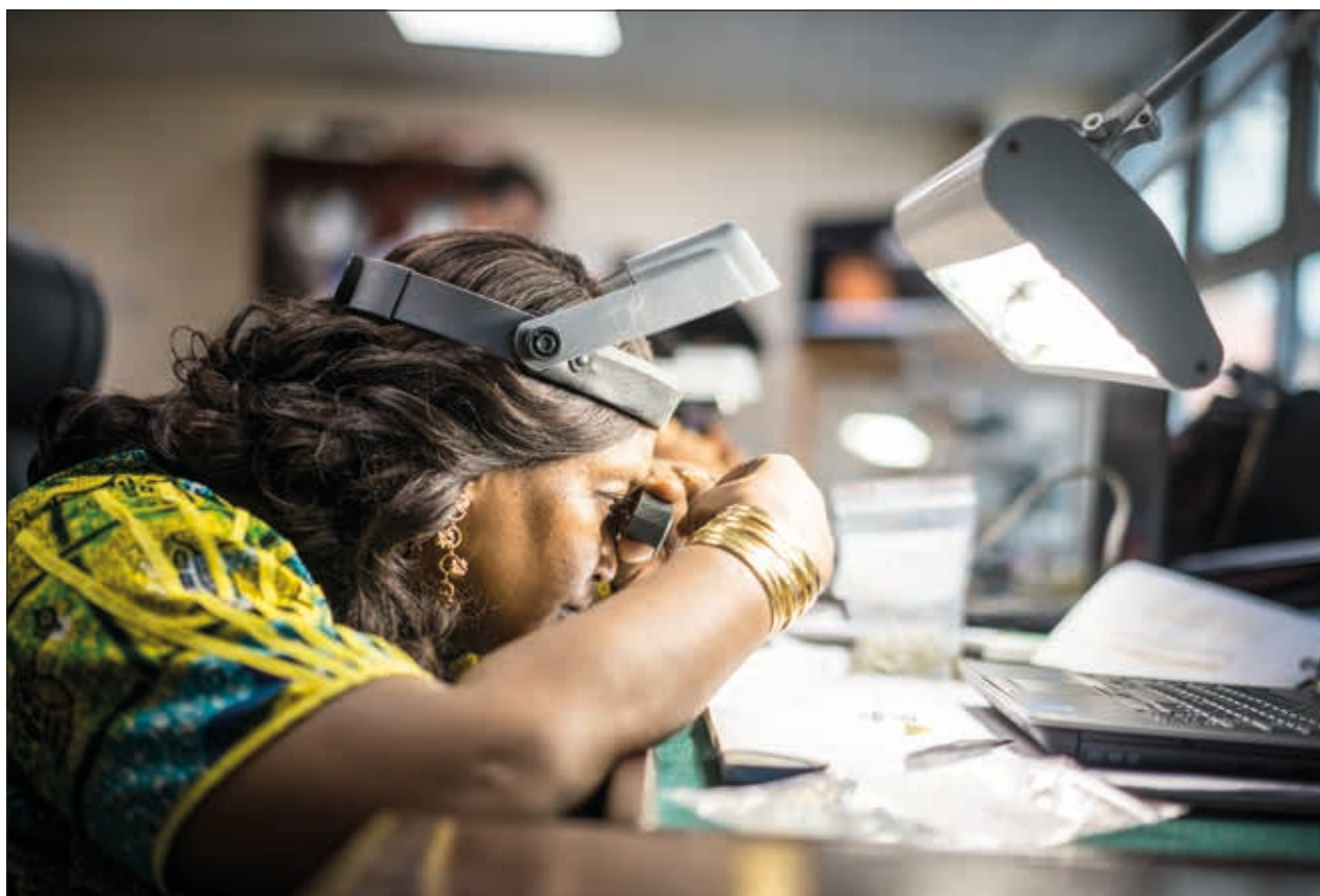
Raw materials and development of small-scale mining (diamonds) in Kono, Sierra Leone, Regional Resource Governance Programme (co-funded by EU and BMZ)