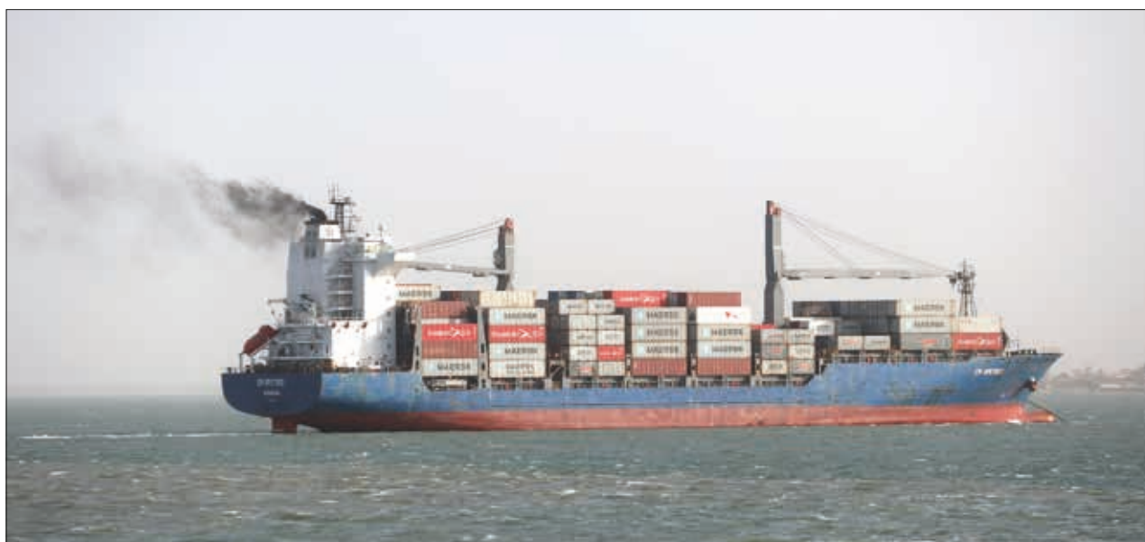
Container ship in Banjul, The Gambia