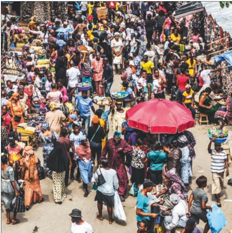
The huge metropolis of Nigeria, Lagos, Photo provided by the Trade Facilitation West Africa Program