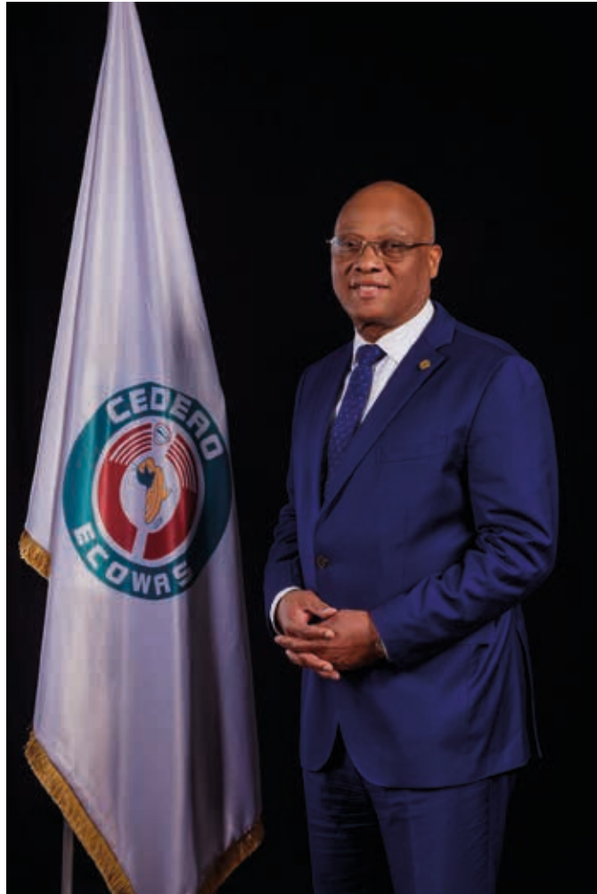
H.E. Jean-Claude Kassi Brou President of the ECOWAS Commission