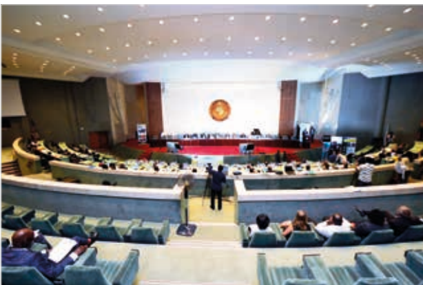
ECOWAS Conference Hall, Abuja, Nigeria