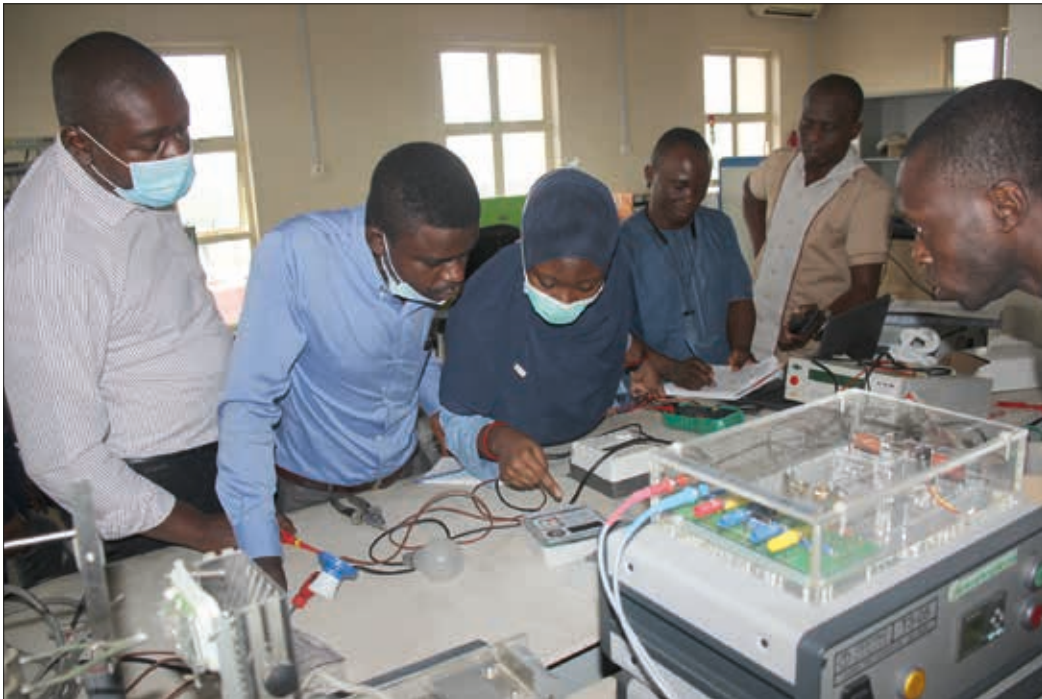
Training on Solar Photovoltaic Standards for staff of Standards Organisation of Nigeria (SON), © GIZ / Melanie Weber