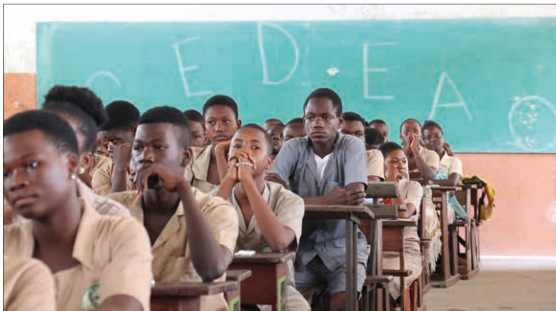
Secondary school in Cotonou, Benin