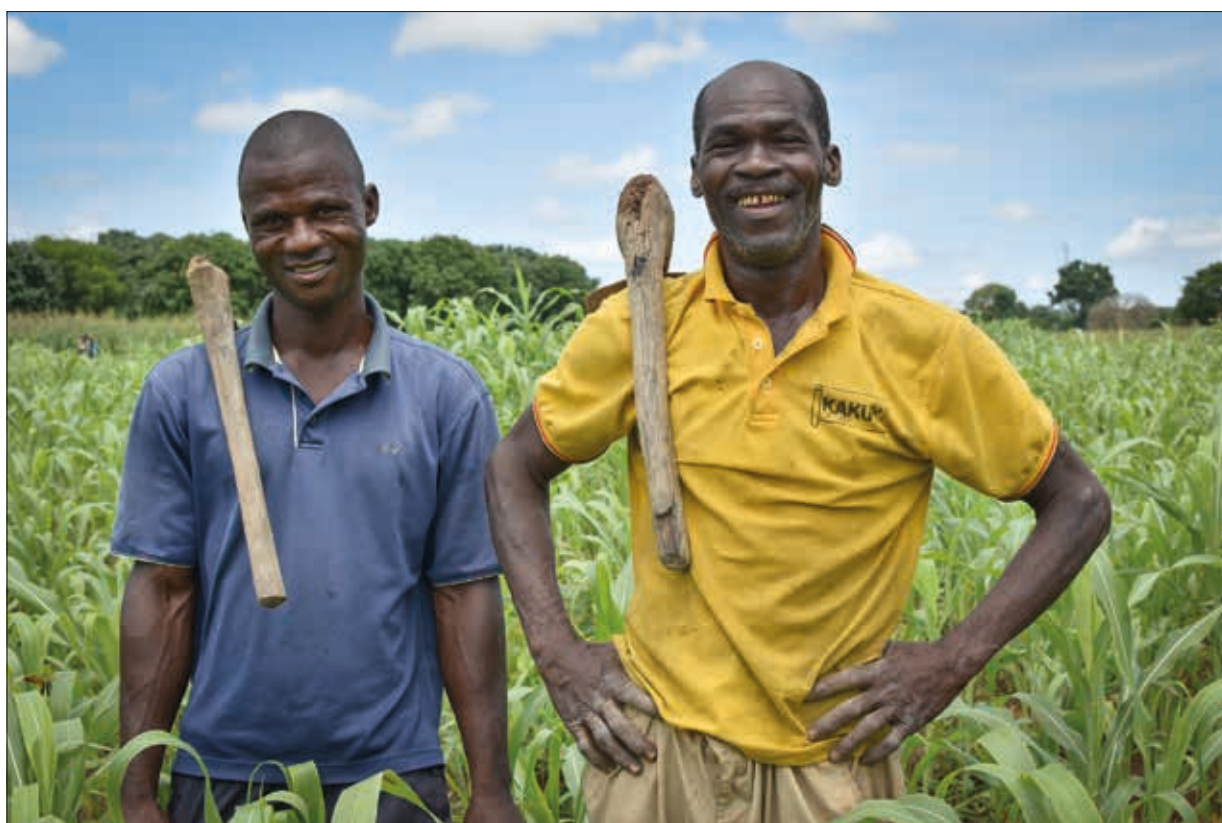
Alliance Sahel, Promoting Sustainable Agriculture, Burkina Faso

iv. Climate Change – Resilience: The region is exposed to various exogenous shocks, economic, political, social, and natural, including climatic change and disasters. All of these underscore the need to build institutional capacities and early warning and resilience mechanisms to better contain in a sustainable manner, the challenges of vulnerability, especially the environmental and climate change challenges.