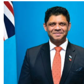
Honourable Aiyaz Sayed-Khaiyum Attorney-General and Minister for Economy

We thank all Fijians for their input and suggestions in taking our country forward.