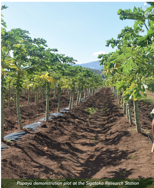
Papaya demonstration plot at the Sigatoka Research Station