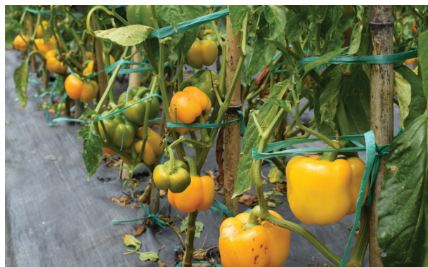
MoA through Research Division Sigatoka launched a new Capsicum variety "Golden Bell"