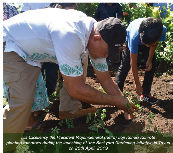
His Excellency the President Major-General (Ret'd) Jioji Konusi Konrote planting tomatoes during the launching of the Backyard Gardening Initiative in Tavua on 25th April, 2019