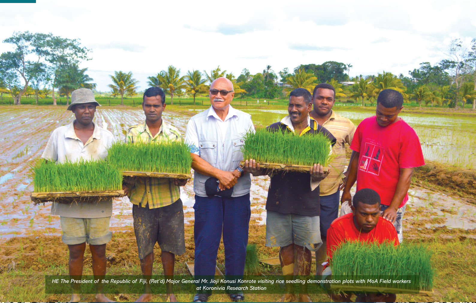
HE The President of the Republic of Fiji, (Ret'd) Major General Mr. Jioji Konusi Konrote visiting rice seedling demonstration plots with MoA Field workers at Koronivia Research Station