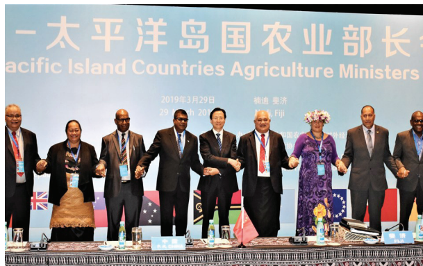
Fiji and China co-hosted the inaugural Roundtable China-Pacific Agriculture Minister's Meeting that adopted the Nadi declaration of China and Pacific Island States on Agricultural Development