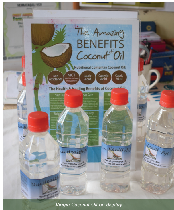
Virgin Coconut Oil on display