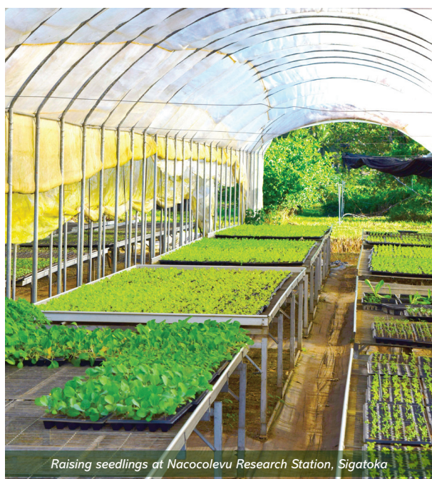
Raising seedlings at Nacocolevu Research Station, Sigatoka

The overall mandate for MoA is to provide food and nutrition security, income and employment to support broad-based economic sector growth. The Government acknowledges the critical role of the Ministry by