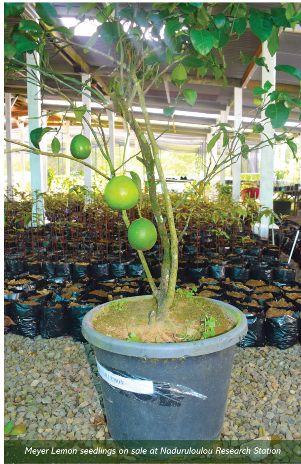
Meyer Lemon seedlings on sale at Naduruloulou Research Station