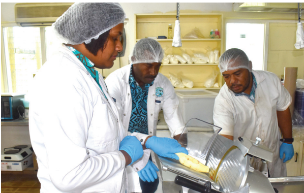
Value Adding with MoA Product Development Unit at KRS