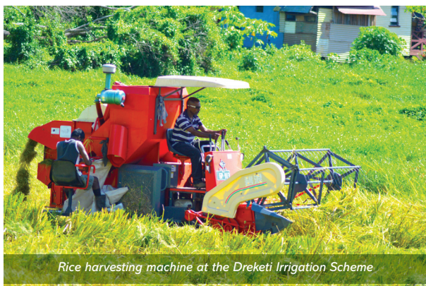
Rice harvesting machine at the Dreketi Irrigation Scheme

the fruit tree orchards program, which covers guava, dragon fruit, banana, mango, avocado and breadfruit. In addition, farmland has been identified to raise seedlings that will be distributed to contracted farmers for improved production. Under a Rural Agricultural Commercial initiative, MoA will work with farmer clusters to identify land for scaling production of market crops such as dalo, cassava, vegetables, rice, pulses and fruit trees. Integrated production systems that promote cover crops, green manuring, nitrogen fixing plants and fertilizer or pesticide management will be strengthened.