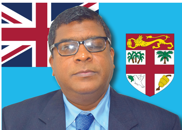
Minister for Agriculture, Rural and Maritime Development, Waterways and Environment, Hon. Dr. Mahendra Reddy

I am delighted to present the Ministry of Agriculture's (MoA) five (5) year Strategic Development Plan (SDP) 2019-2023 that aims to deliver on the collective aspirations of our people through a demand-driven and resilient agriculture sector which provides economic opportunities, environmental sustainability and food and nutrition security for all Fijians. This will be achieved through five key strategic priorities: food nutrition, sustainable livelihoods, climate resilience, commercial agriculture and strengthened service delivery.