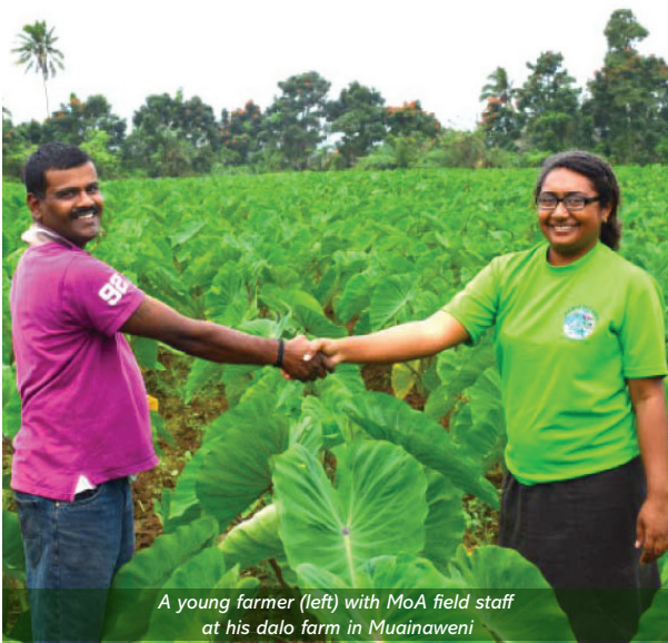
A young farmer (left) with MoA field staff at his dalo farm in Muainaweni

In promoting backyard gardening in urban and peri-urban areas for food security and nutritional improvement, the Ministry will pilot the distribution of backyard gardening packages. Interested recipients will have to complete Gardener Profile Forms for monitoring and evaluation of their gardens.