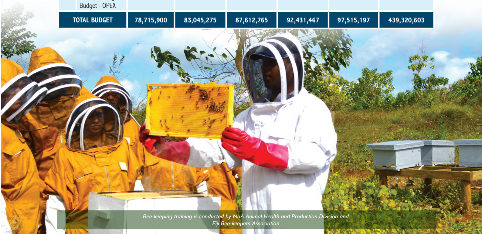
Bee-keeping training is conducted by MoA Animal Health and Production Division and Fiji Bee-keepers Association