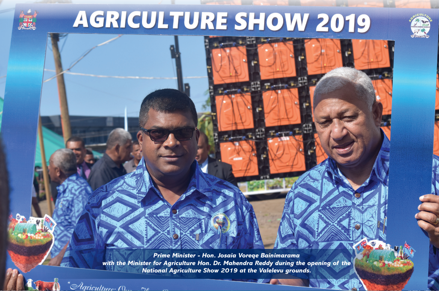
Prime Minister - Hon. Josaia Voreqe Bainimarama with the Minister for Agriculture Hon. Dr. Mahendra Reddy during the opening of the National Agriculture Show 2019 at the Valelevu grounds.