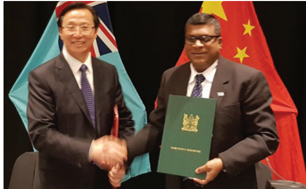
Fiji and China signed MOU on Agricultural Cooperation