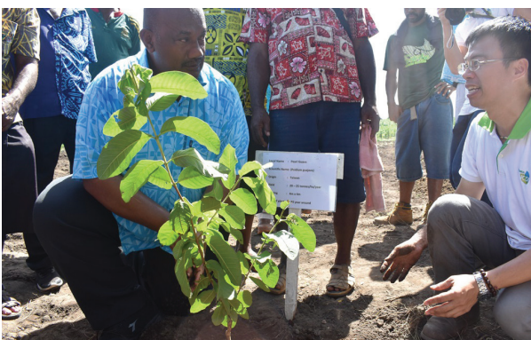
MoA launched first fruit tree orchards