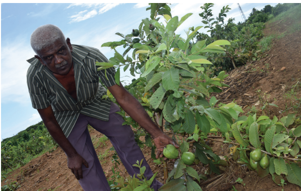
MoA launched a new guava variety called "Green Pearl"