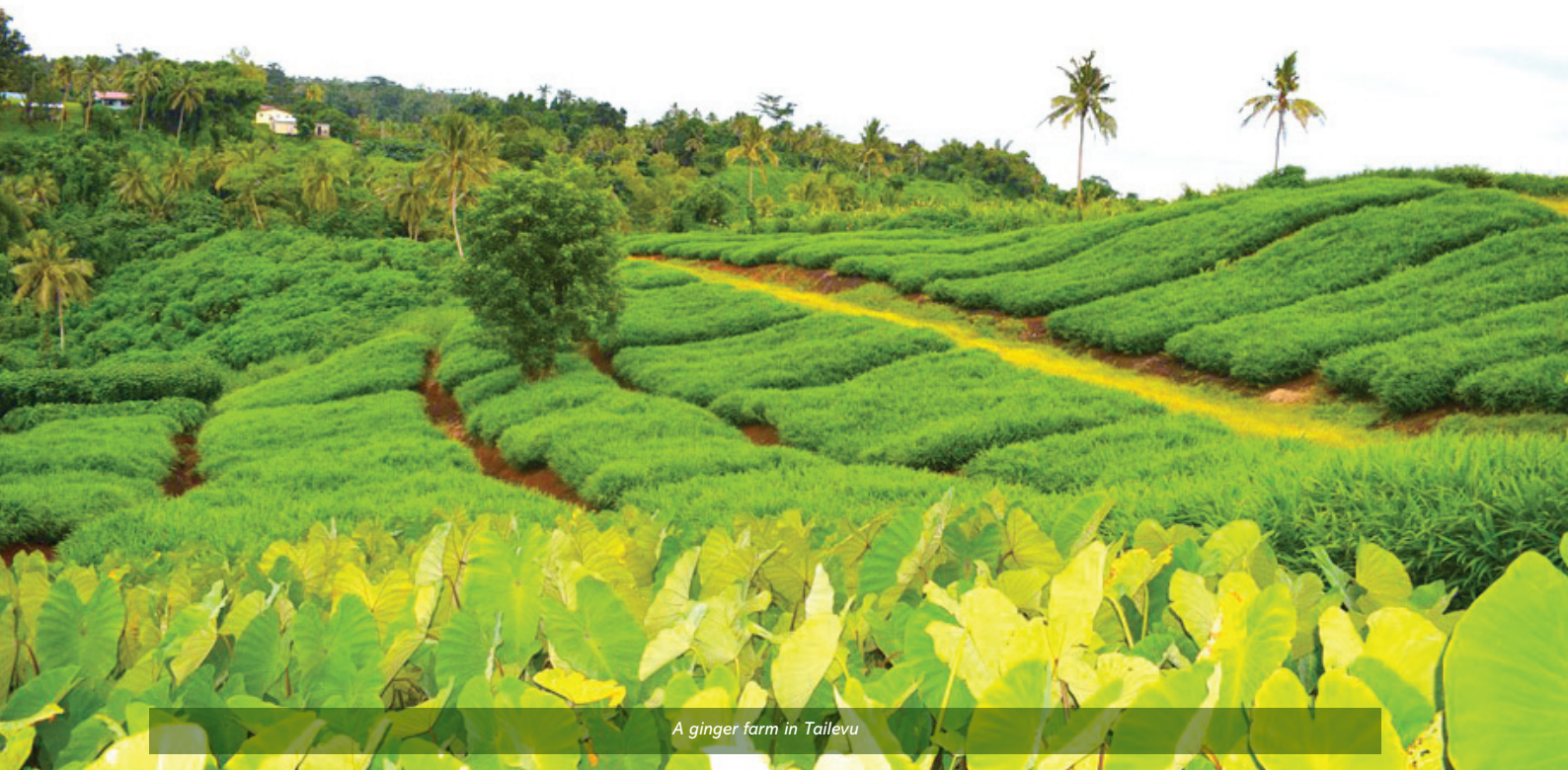
A ginger farm in Tailevu