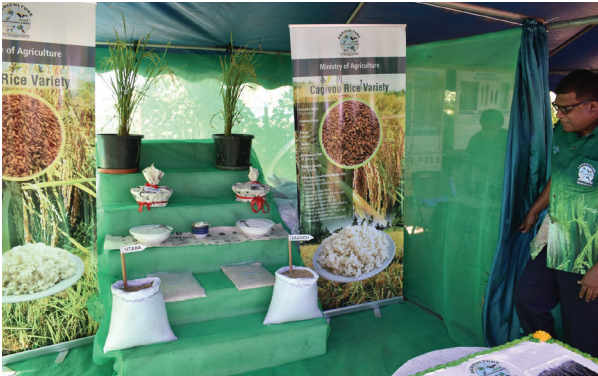
Ministry launched 2 new rice varieties - Sitara and Cagivou