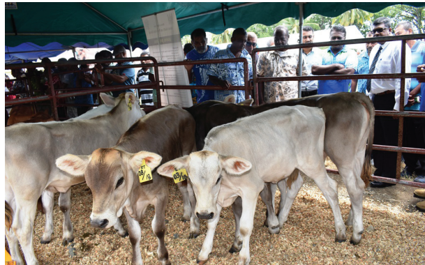
New calf breed (Brown Swiss) through Embryo Transfer Program