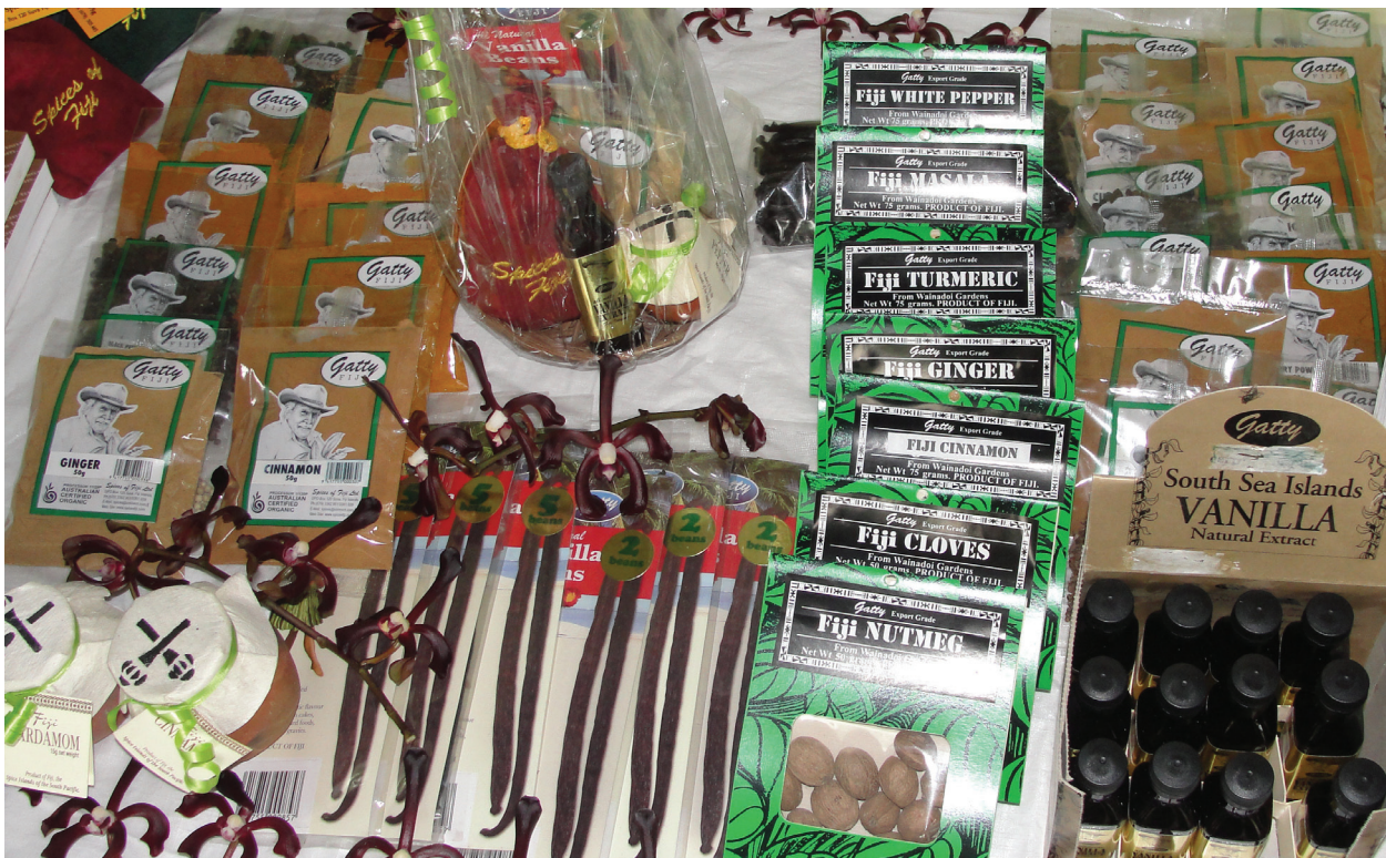
Agro-products from Gatty's farm on display at a recent Food Show

A more detailed discussion of the Situation Analysis is contained in the MoA website: www.agriculture.gov.fj .