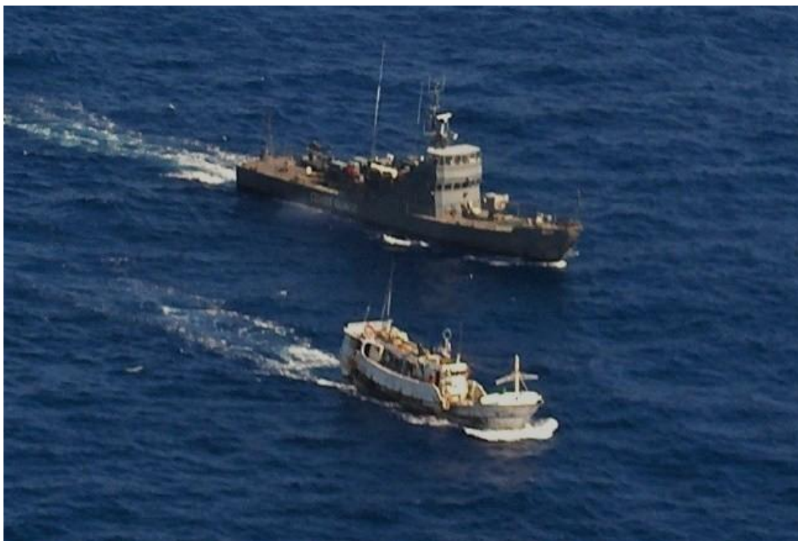
The Mauritian Patrol vessel, “Guardian” escorting to Port-Louis a foreign fishing vessel caught fishing illegally in the Mauritian EEZ

At national level, the Fisheries Division and the National Coast Guard hold regular meetings to take stock of surveillance activities and to plan future programmes. Joint air and sea patrols are undertaken by the officers of the two organisations.