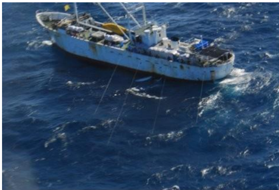
A foreign vessel caught fishing without a licence

The consultations between the Fisheries Division, the Shipping Division of the Ministry of Public Infrastructure, Land Transport and Shipping, the NCG, the Meteorological Services, the Mauritius Ports Authority, the Mauritius Telecom and the fishing industry operators will be maintained and organised more regularly.