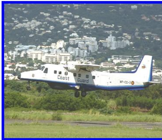
The NCG “Dornier” aircraft

Local boats or vessels are also required to be registered prior to the issue of fishing licences. Vessels less than 24 metres in length overall are registered under Section 42 of the Fisheries and Marine Resources Act 2007, while those above 24 metres are registered by the Shipping Division of the Ministry of Public Infrastructure, Land Transport and Shipping under the Merchant Shipping Act.