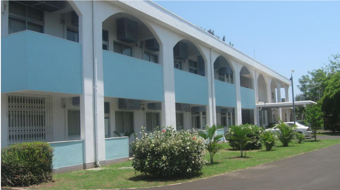
Albion Fisheries Research Centre