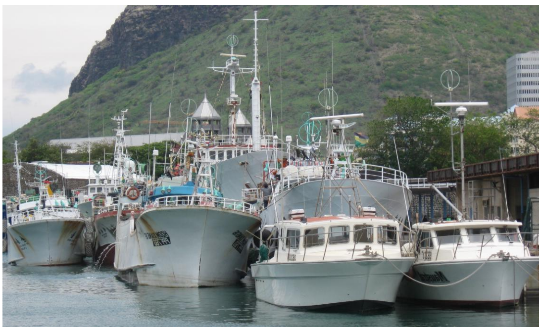
Fishing Vessels at Port Louis Fishing Port