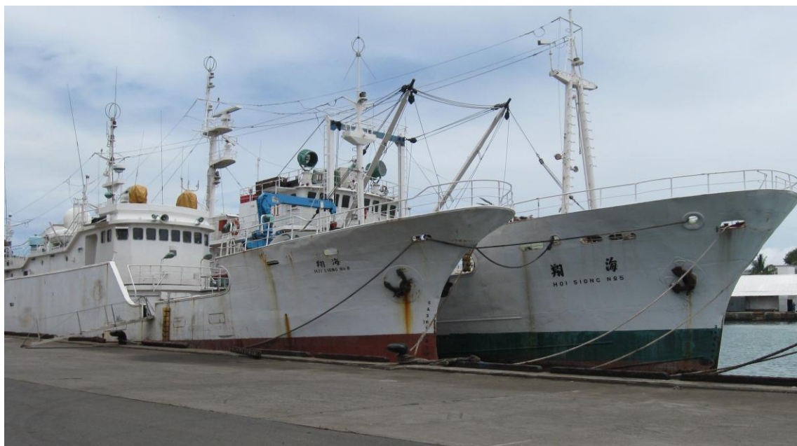
Fishing Vessels at Port Louis

On the arrival of each fishing vessel at Port Louis, the skipper has to submit logbook and landing data to AFRC. Length frequency data are also collected during the landing of the catch.