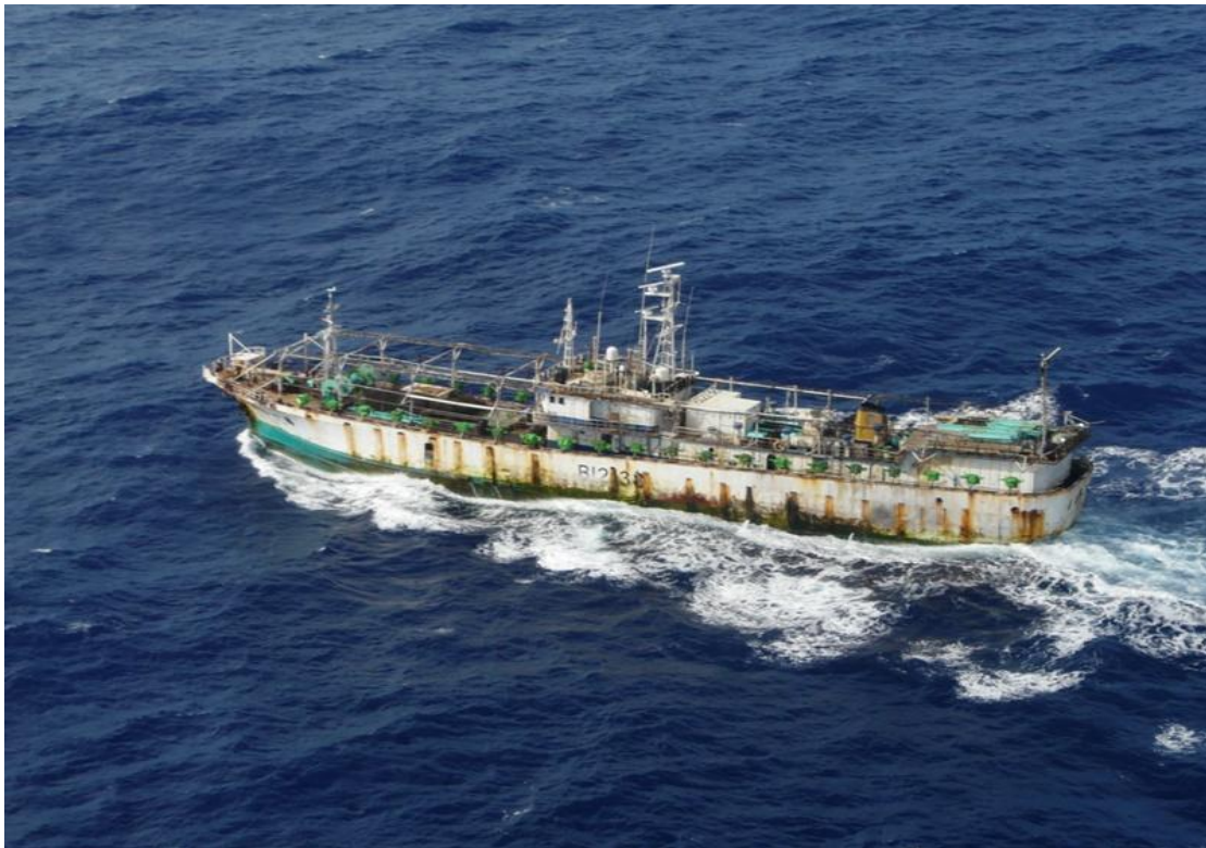
Vessel sighted by NCG as operating without flag