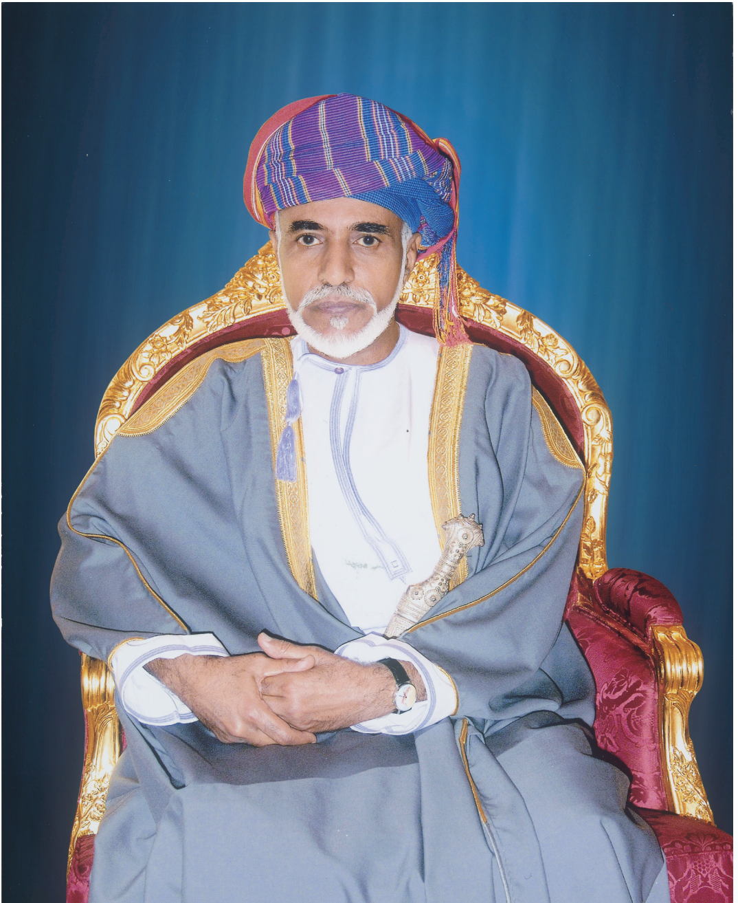
His Majesty Sultan Qaboos Bin Said