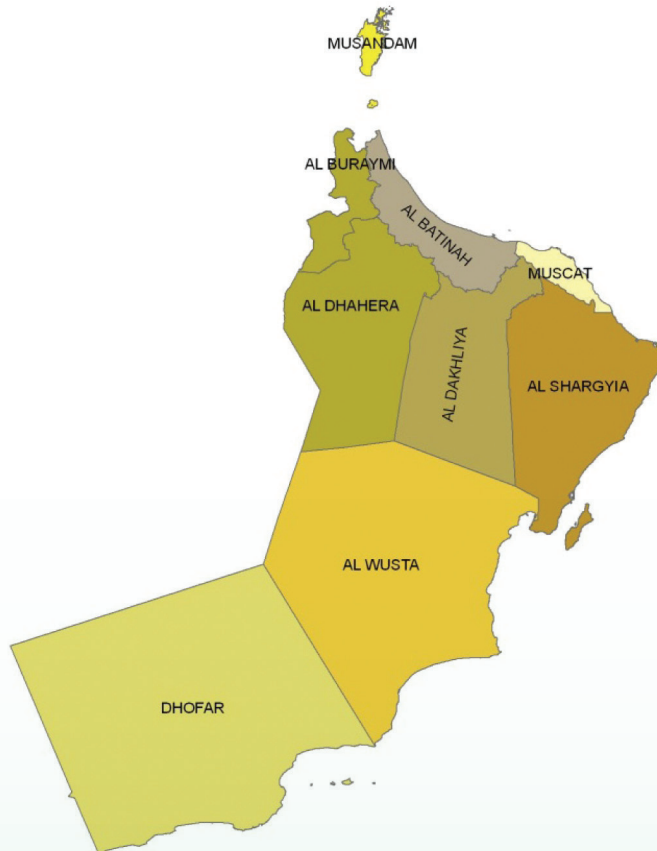
Fig. 1. Geographical Regions of Oman

The Sultanate of Oman occupies the eastern corner of the Arabian Peninsula, stretching more than 1700 km from the Strait of Hormuz in the north to the frontiers of Yemen in the south. The Musandam peninsula, the most northern point of Oman is separated from the rest of the country by Fujaira, which is one of the United Arab Emirates (Fig. 1). The country is located between latitudes 16° 40'N and 26° 20'N and longitude 51°E and 59° 40'E. It occupies total area of about 309,500 sq. km, of which mountains, deserts and coastal plains represent 16%, 81% and 3%, respectively. It can be divided into the following physiographic regions, (i). the whole coastal plain- the most important parts are the Batinah Plain in the north, which is the principal agricultural area, and the Salalah Plain in the south; (ii). the mountain ranges- that run in the north close to the Batinah Plain is the Al-Jabal Al-Akhdar with a peak at 3,000 meters and in the extreme southern part of the country, with peaks from 1,000 to 2,000 meters and (iii). the interior regions- which lay between the coastal plain and the mountains in the north and south consist of several plains with elevations not exceeding 500 meters.