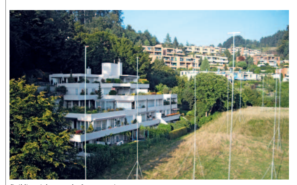
Building right up to the forest margin

The forest shall be fundamentally conserved in its spatial distribution and shall not decrease in its area. The further development of forest area shall be coordinated with landscape diversity (including connectivity) and targeted spatial development (including agricultural priority areas).