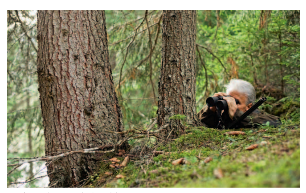
Regulation of game stocks through hunting

The forest shall provide sufficient living space and quiet for wild animals. Game stocks shall be adapted to their habitats and have a natural age and gender distribution. The natural regeneration of forests with tree species suited to their locations shall not be hindered by wild ungulates.