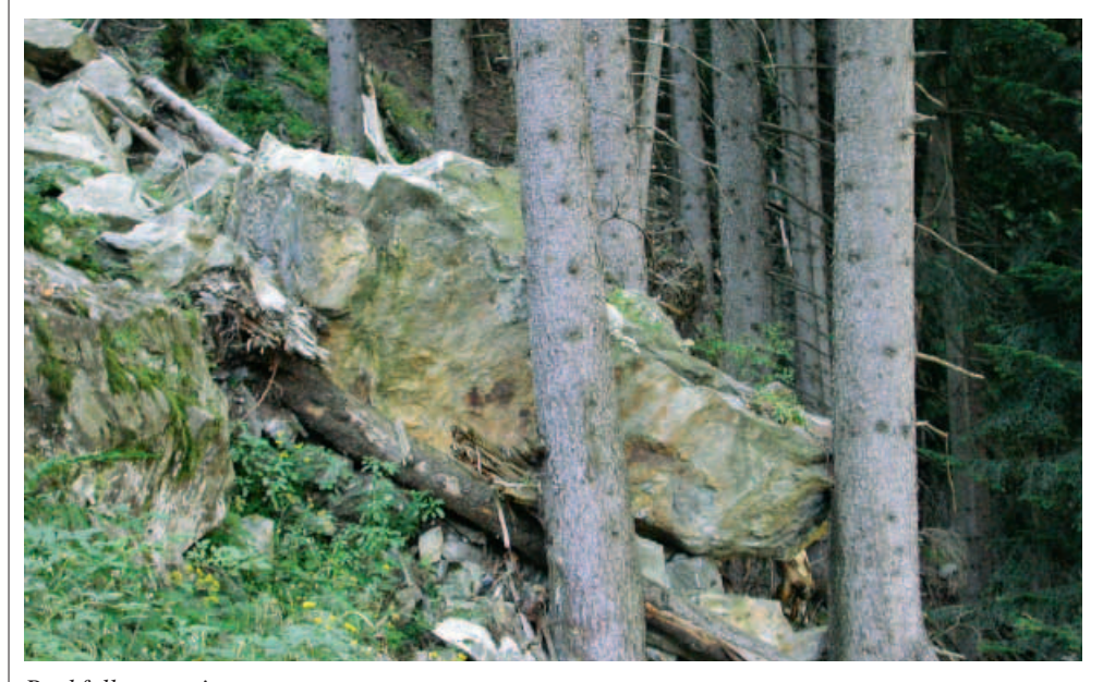
Rockfall protection