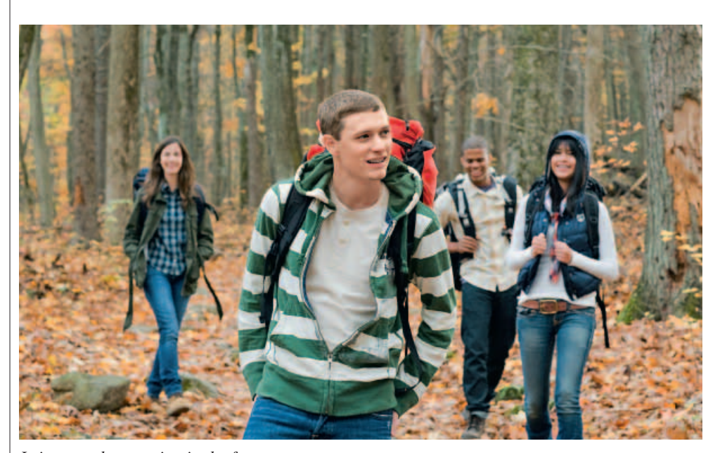
Leisure and recreation in the forest