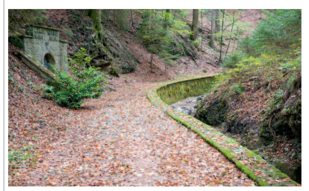
Spring box in the forest