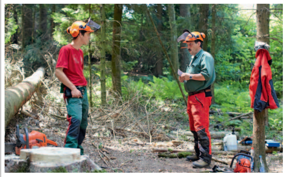
Forest warder training