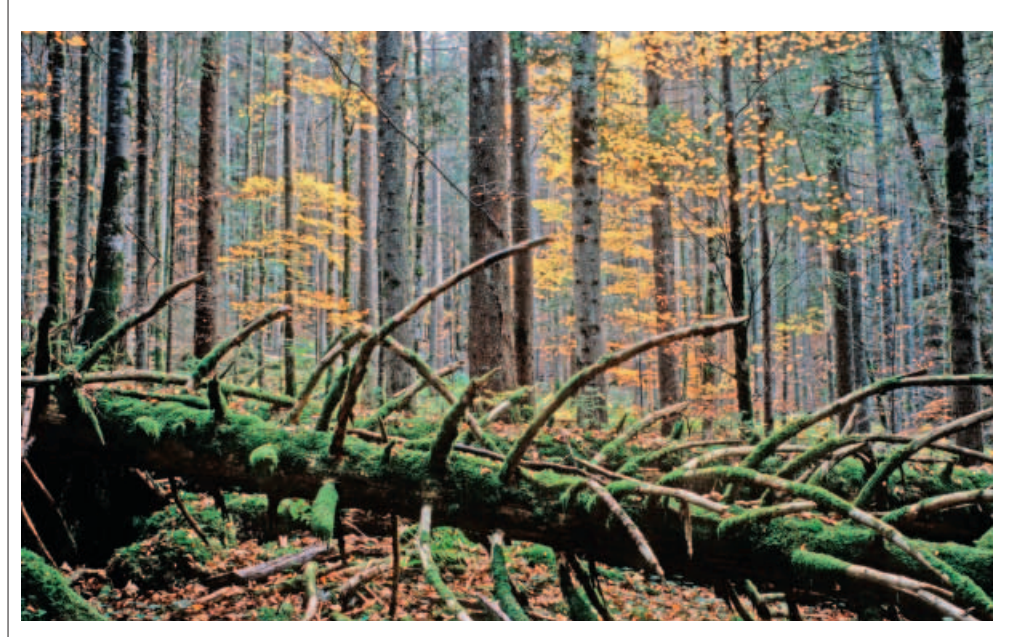
Biodiversity-rich dead wood

The species living in the forest and the forest as a near-natural ecosystem shall be conserved. Aspects of biodiversity in which deficits exist shall be improved.