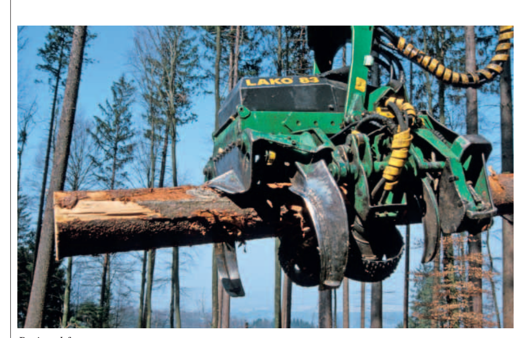
Rational forest management

The efficiency and performance of the Swiss forestry sector and, therefore, the structure of forestry operations and cooperation beyond ownership structures shall improve. The additional expenses incurred by managers for the provision of the desired forest services, or corresponding losses in income, shall be compensated.