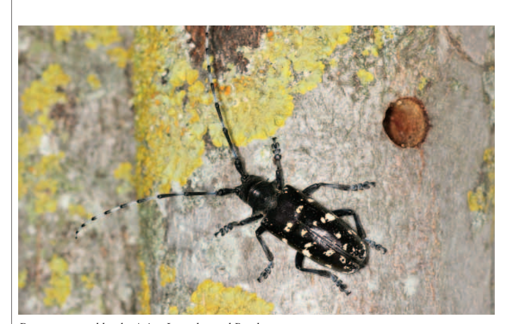
Damage caused by the Asian Long-horned Beetle

The forest shall be protected against the introduction of particularly hazardous harmful organisms. The infestation and spread of organisms shall not exceed an acceptable level from the perspective of forest services.