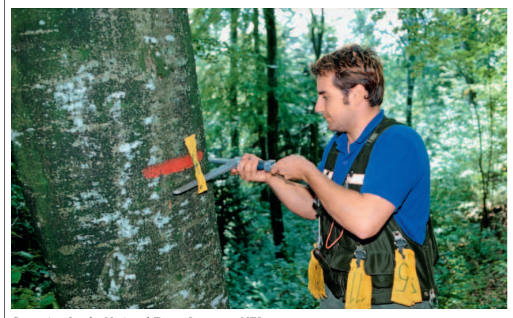
Surveying for the National Forest Inventory NFI

Some strategic directions serve the fulfilment of the objectives defined for several areas and cannot be clearly assigned to a particular objective. Hence, they are presented in this chapter and are based on the general objective that the Swiss forest be managed in a way that enables it to fulfil is functions and services sustainably and equally.