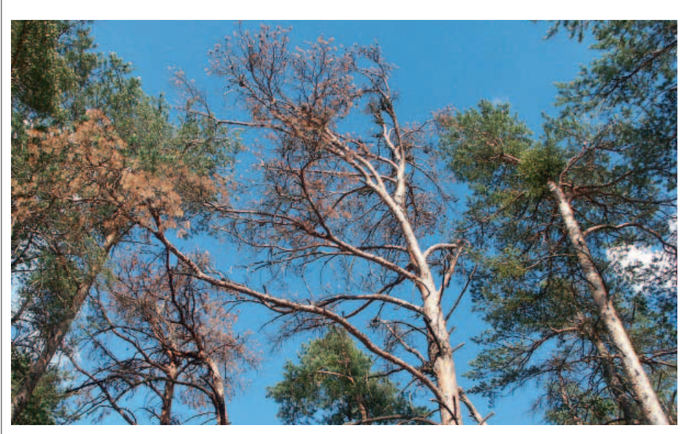
Dying pine forest in Valais