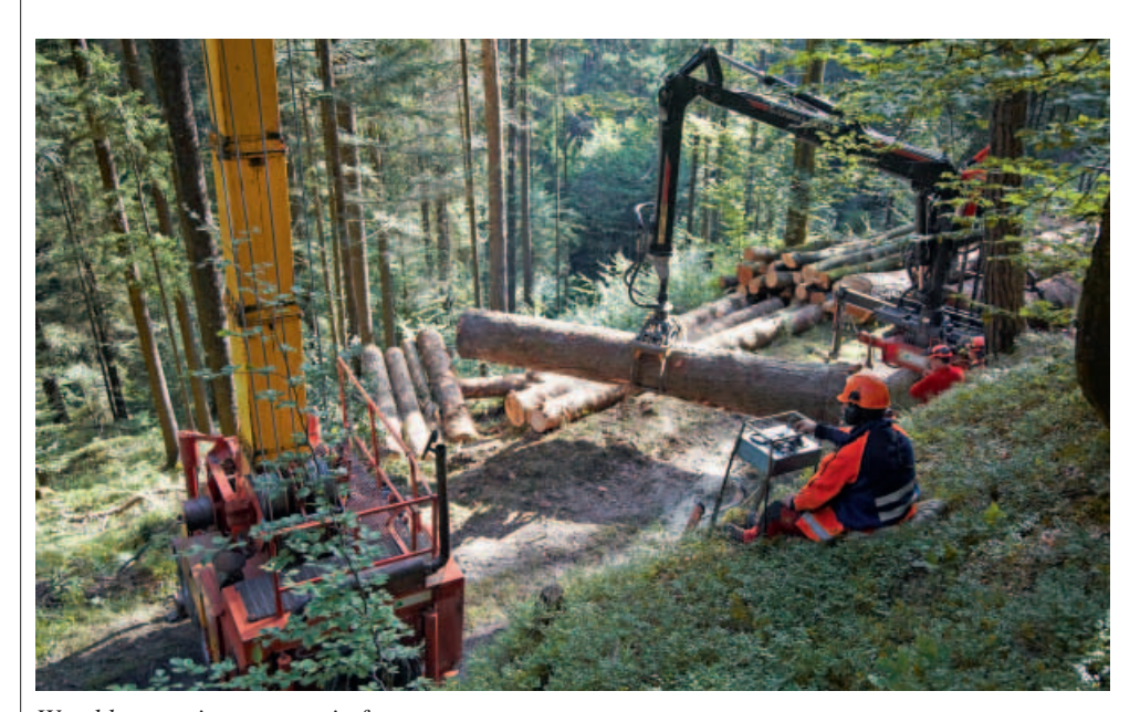
Wood harvest in a mountain forest

Taking local conditions into account, the wood harvest potential of the Swiss forest that can be harvested sustainably shall be exhausted.