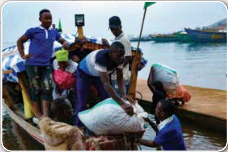
© Tanzania NPoA Team, June 2020