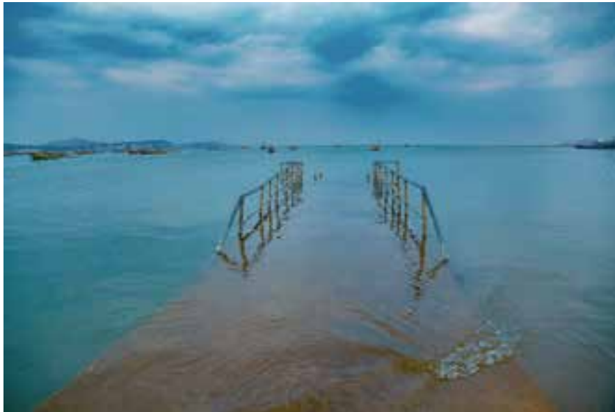
© Tanzania NPoA Team, June 2020.