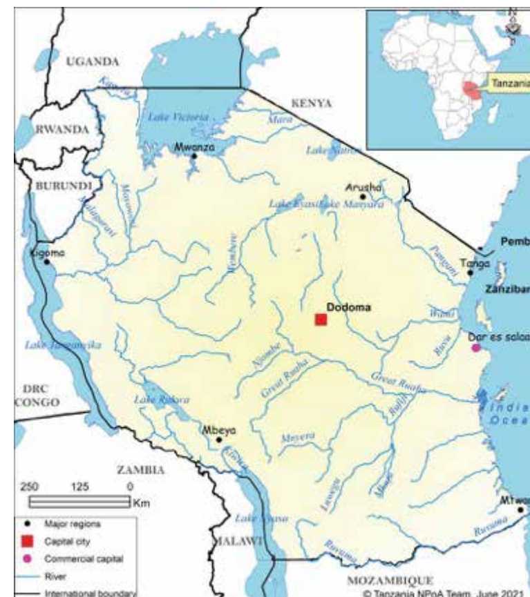
Figure 1: Map of Tanzania showing major fishing water bodies.

These water bodies are widely distributed in the country as illustrated in Map 1, equally indicating the wider participation of people in the Tanzanian small-scale fisheries.