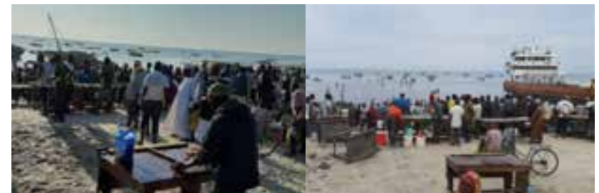
© Tanzania NPoA Team, June 2020