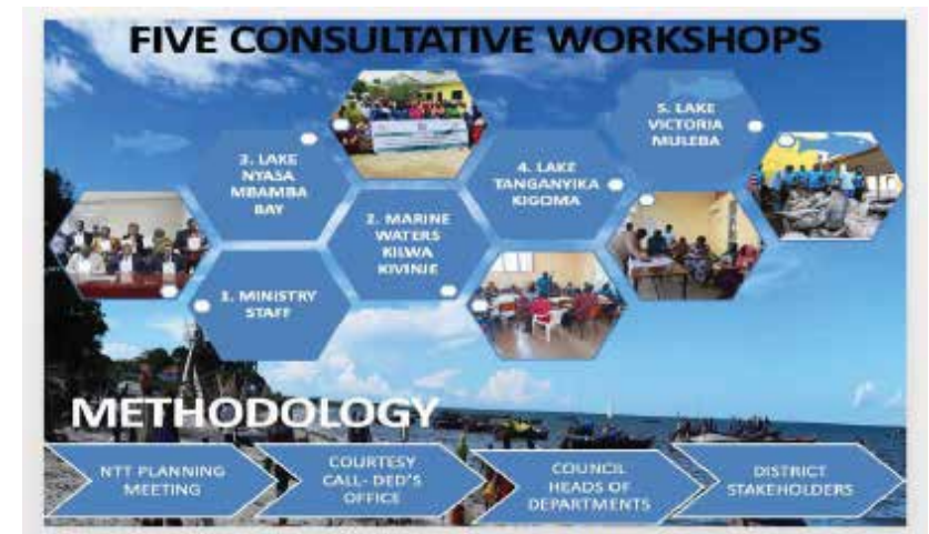
Plate 1: The Consultative Process

The NPoA was developed through nine multi-stakeholder consultations involving 6,729 fisheries stakeholders. They comprised of policy makers, fisheries managers, fishers, fish traders, fish processors, net menders, food vendors, fish carriers, gear suppliers and fish transporters.