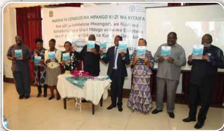
© Tanzania NPoA Team, June 2021