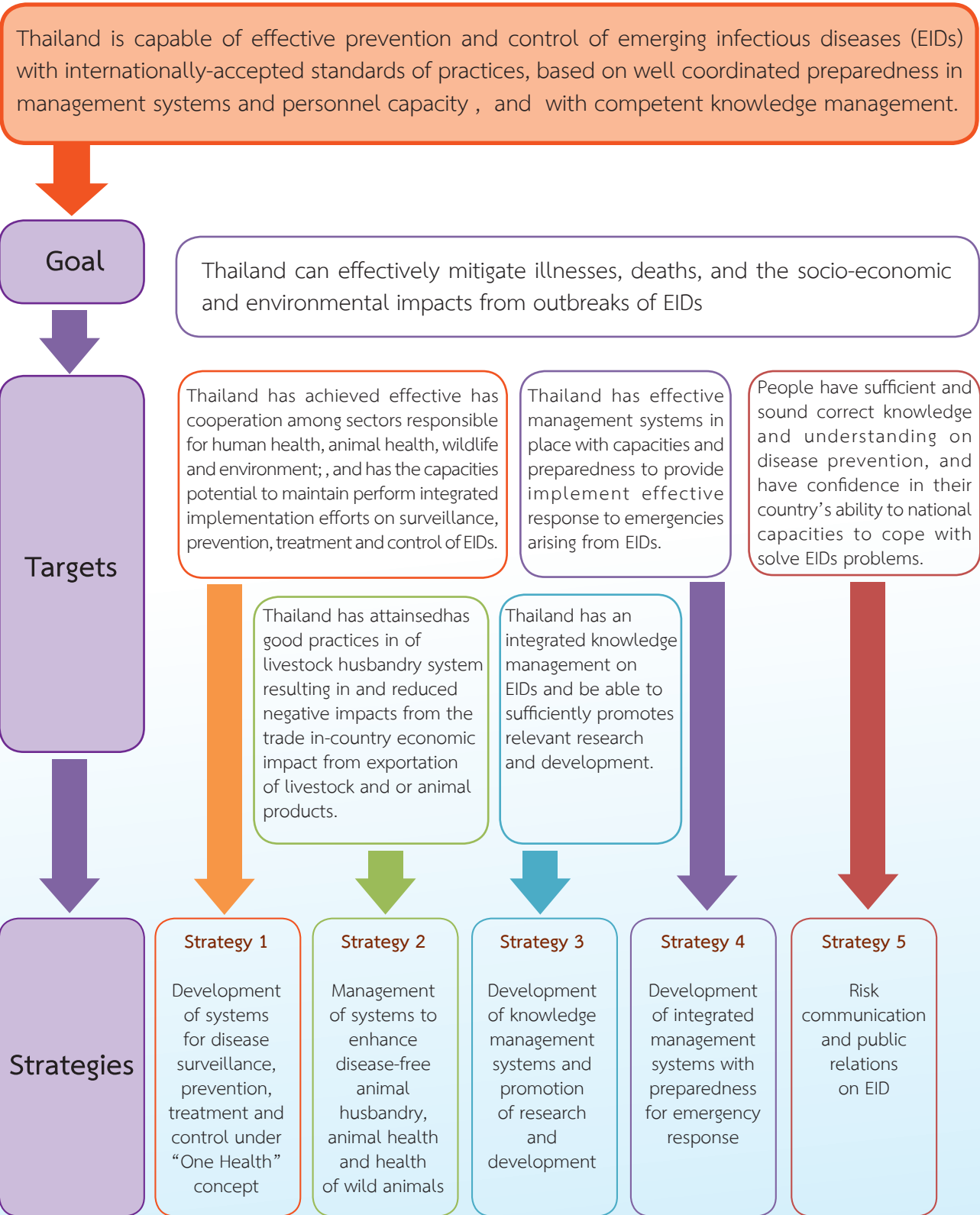
Figure 1 Linkages of vision, goal, objectives, and strategies for EID management