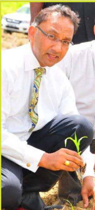
Senator the Honourable Vasant Bharath Minister of Food Production, Land and Marine Affairs

Worldwide there is growing concern and alarm by Governments concerning food security; rising food prices; food price volatility; declining production levels due to climate change; rising demand because of economic and population growth in developing countries; and pressure on food supplies due to the increased demand for bio-fuels.