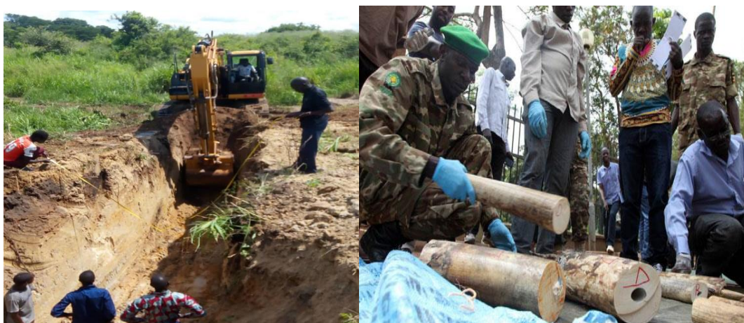
Trench to mitigate Human-wildlife conflict. Ivory confiscated from traffickers