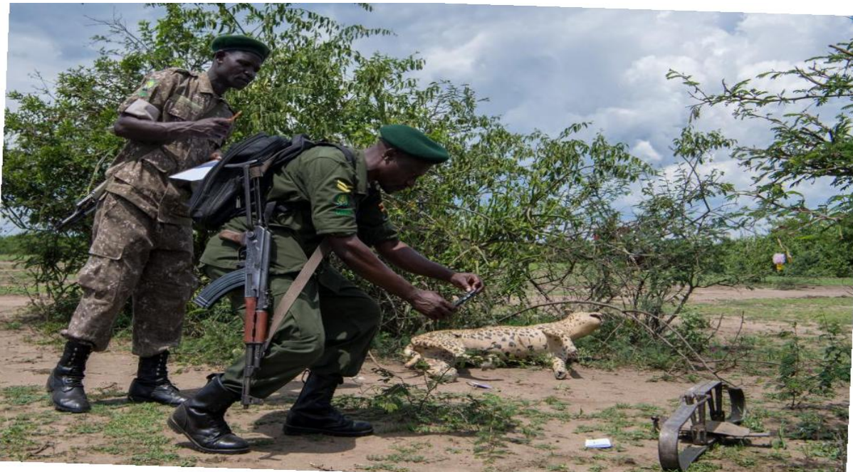
Leopard killed by Metal Trap laid by poachers

Wildlife poaching: continues to pose a big challenge to wildlife conservation. Poaching takes the form of traditional/customary hunting practices targeting wildlife for food, medicine or for provision of trophies used in cultural practices such as the Black and White Colobus monkey skin used by Bamasaba during circumcision rituals. This form of poaching mainly targets antelopes, small mammals, primates etc. using rudimentary tools such as spears, snares, poisoned baits, traps, etc. both within and outside protected areas. Overtime, poaching has increasingly become widespread and commercially oriented. It is this form of poaching that contributes to in-country trade in wildlife products and also sources of some of the trafficked wildlife and wildlife products.