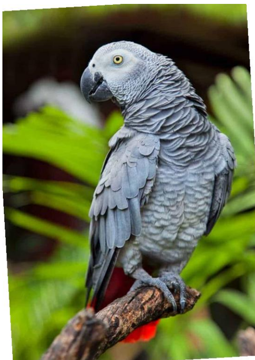
The African grey parrot ( Psittacus erithacus ) is one of the most illegally traded/ trafficked Bird