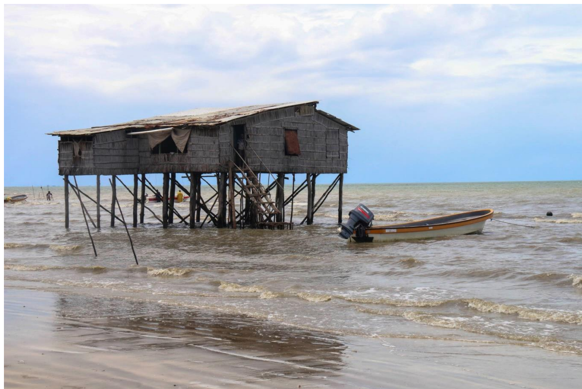
Figure 3: Treaty village house impacted by rising high tides

The Provincial Administration acknowledges the need to undertake planning, and particularly to better inform infrastructure, access to clean water, and agriculture activities in regard to adapting to, and mitigating, the impact of climate change and sea-level rise.