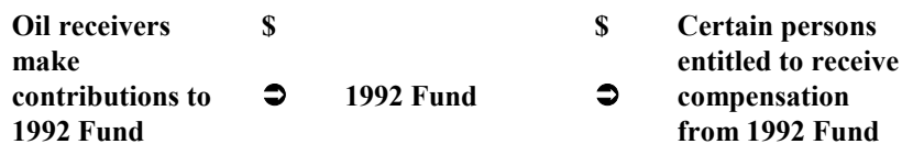
Diagram showing flow of money