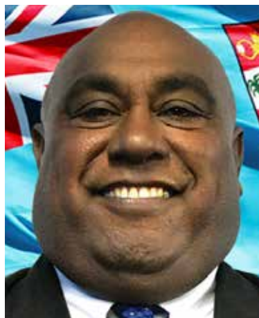
Mr. Semi T. Koroilavesau Hon. Minister for Fisheries

Within each strategic priority/outcome, key performance indicators are clearly stated to monitor implementation.