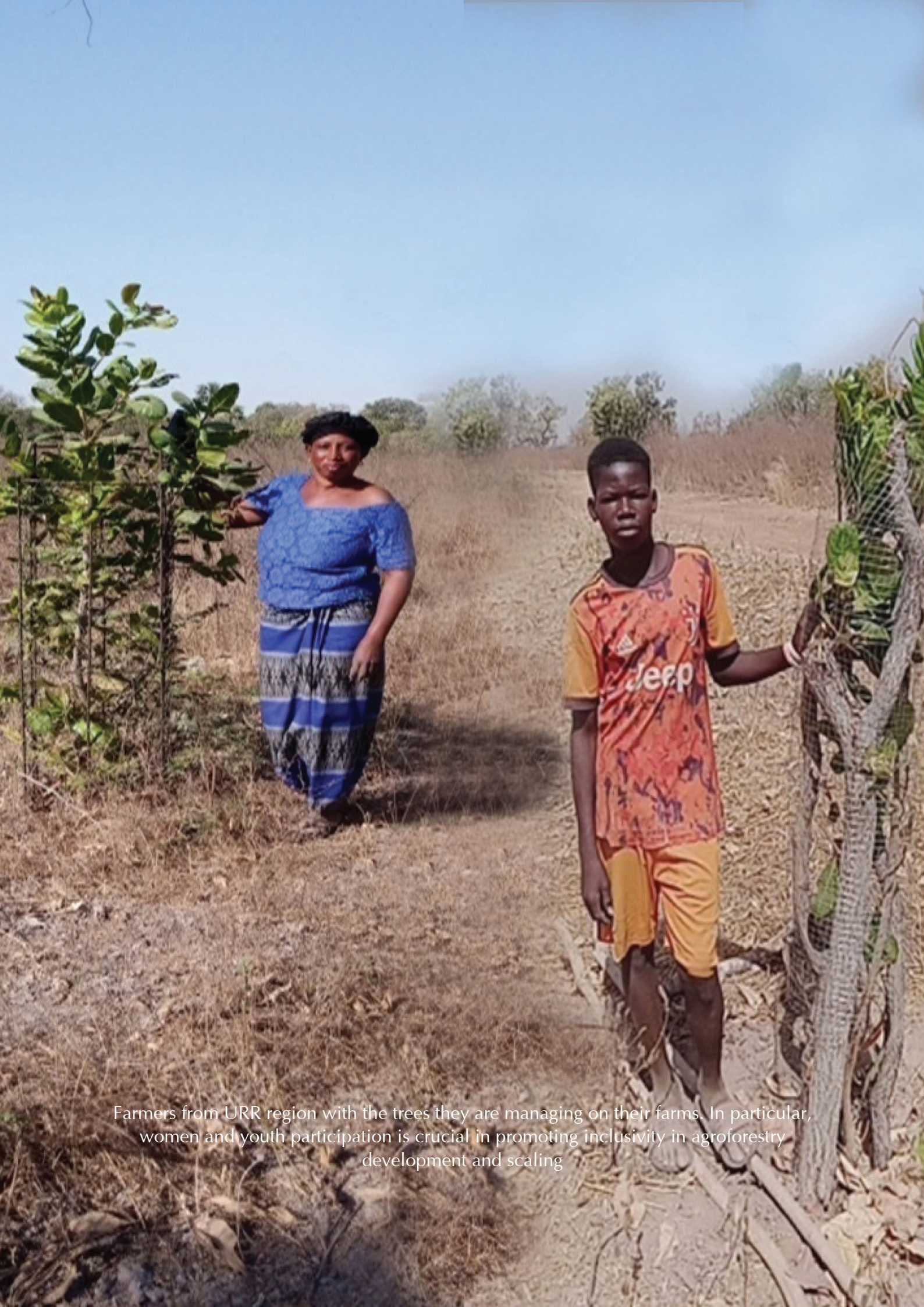
Farmers from URR region with the trees they are managing on their farms. In particular, women and youth participation is crucial in promoting inclusivity in agroforestry development and scaling