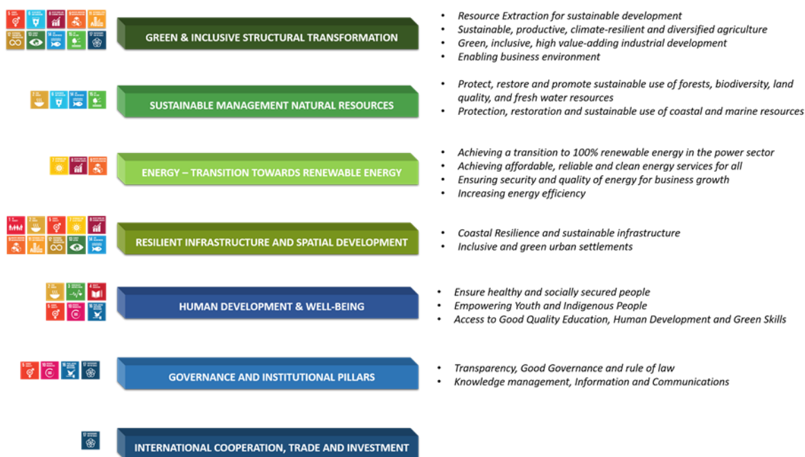
Figure 3. Central themes of the GSDS and its relation with the SDGs

Seven central themes will be comprehensively developed and implemented, responding to the country's human and economic development, and addressing both the "Energy Transition Plan" and the implementation of the Sustainable Development Goals at the national level. See Figure 3.