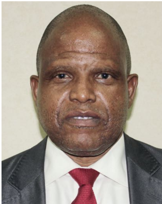
Honourable Mokoto Hloaele Minister of Energy & Meteorology

W ith enormous impacts on the biophysical environment and socio – economic growth and development, climate change is one of the greatest global environmental challenges facing mankind.