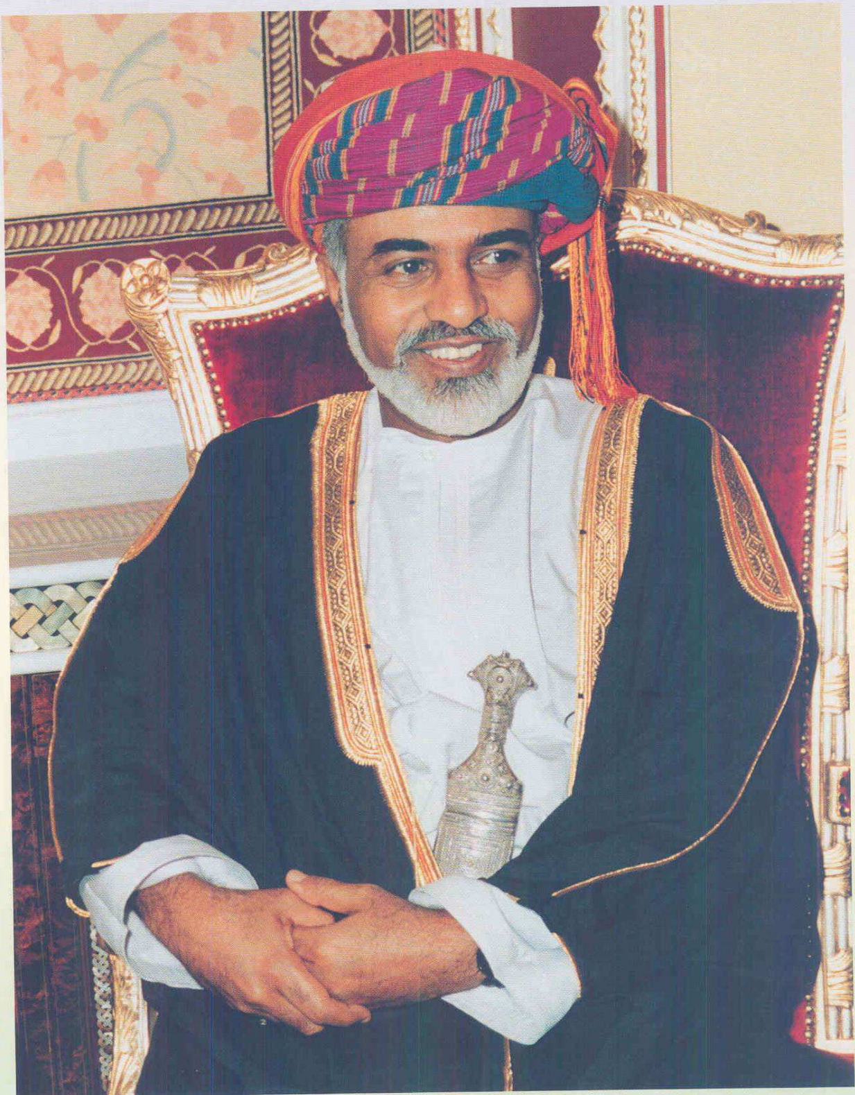
His Majesty Sultan Qaboos Bin Said