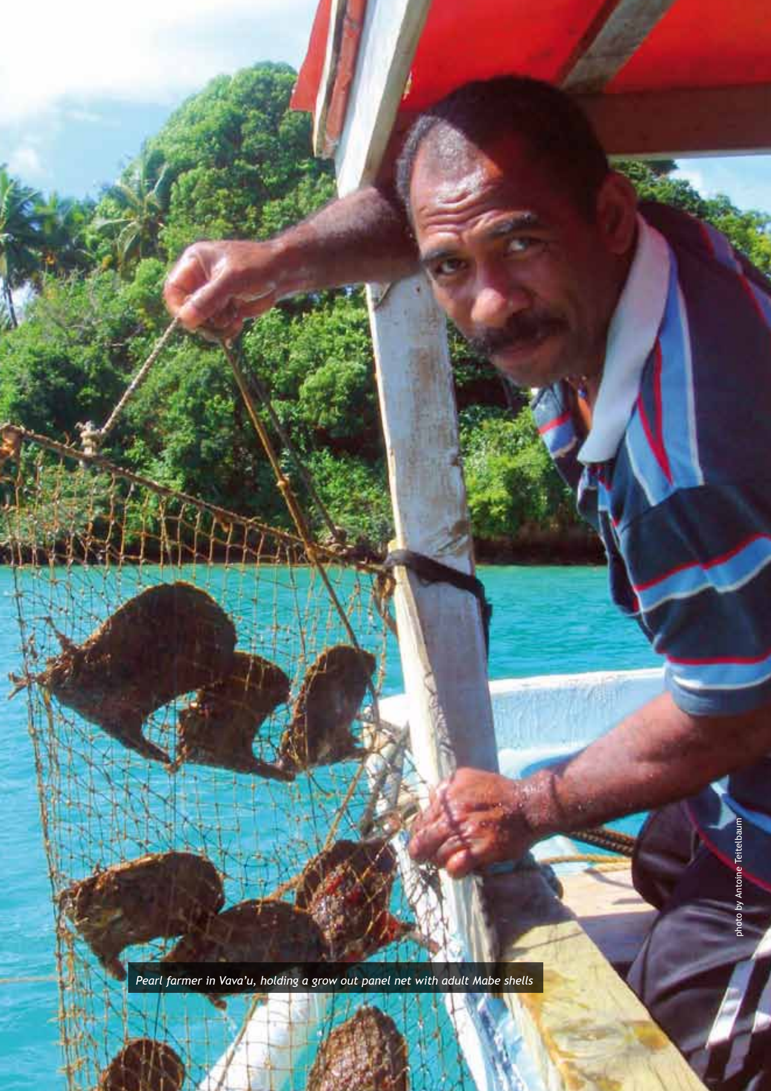
Pearl farmer in Vava'u, holding a grow out panel net with adult Mabe shells