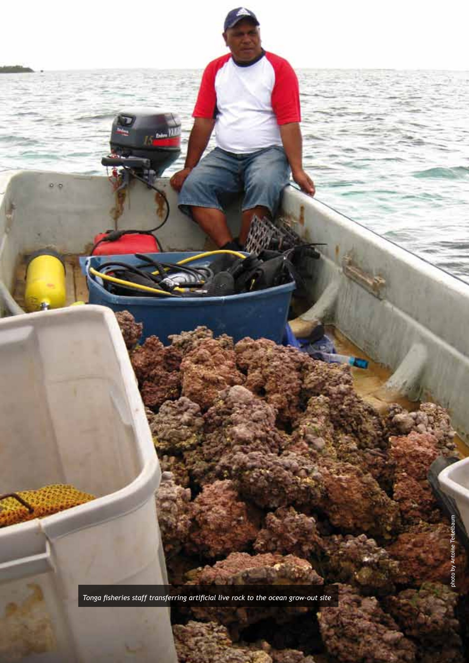
Tonga fisheries staff transferring artificial live rock to the ocean grow-out site