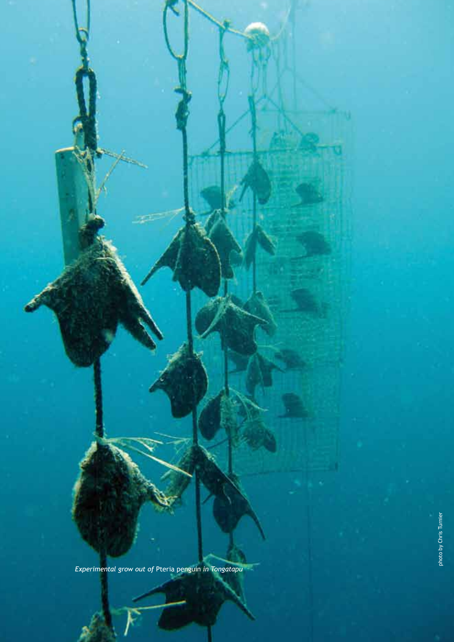
Experimental grow out of Pteria penguin in Tongatapu