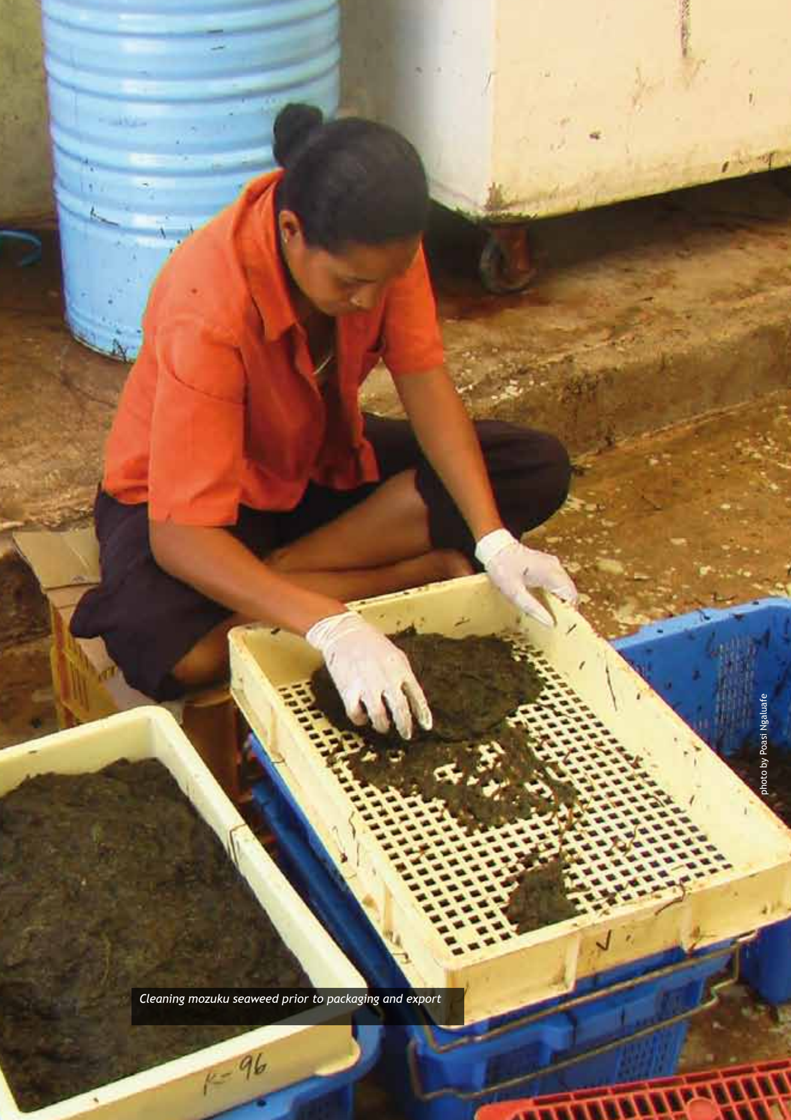
Cleaning mozuku seaweed prior to packaging and export