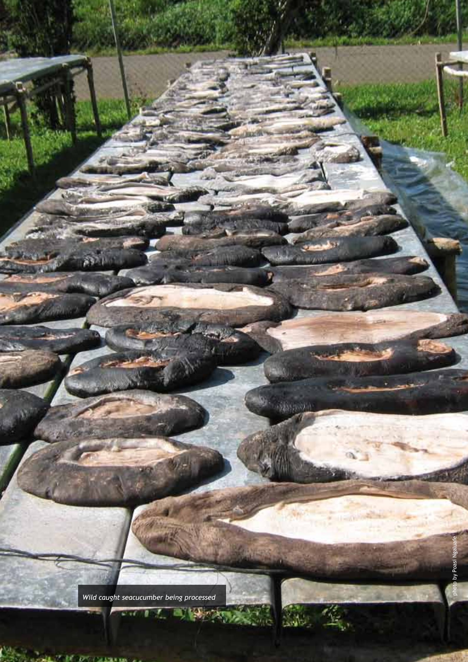
Wild caught seacucumber being processed