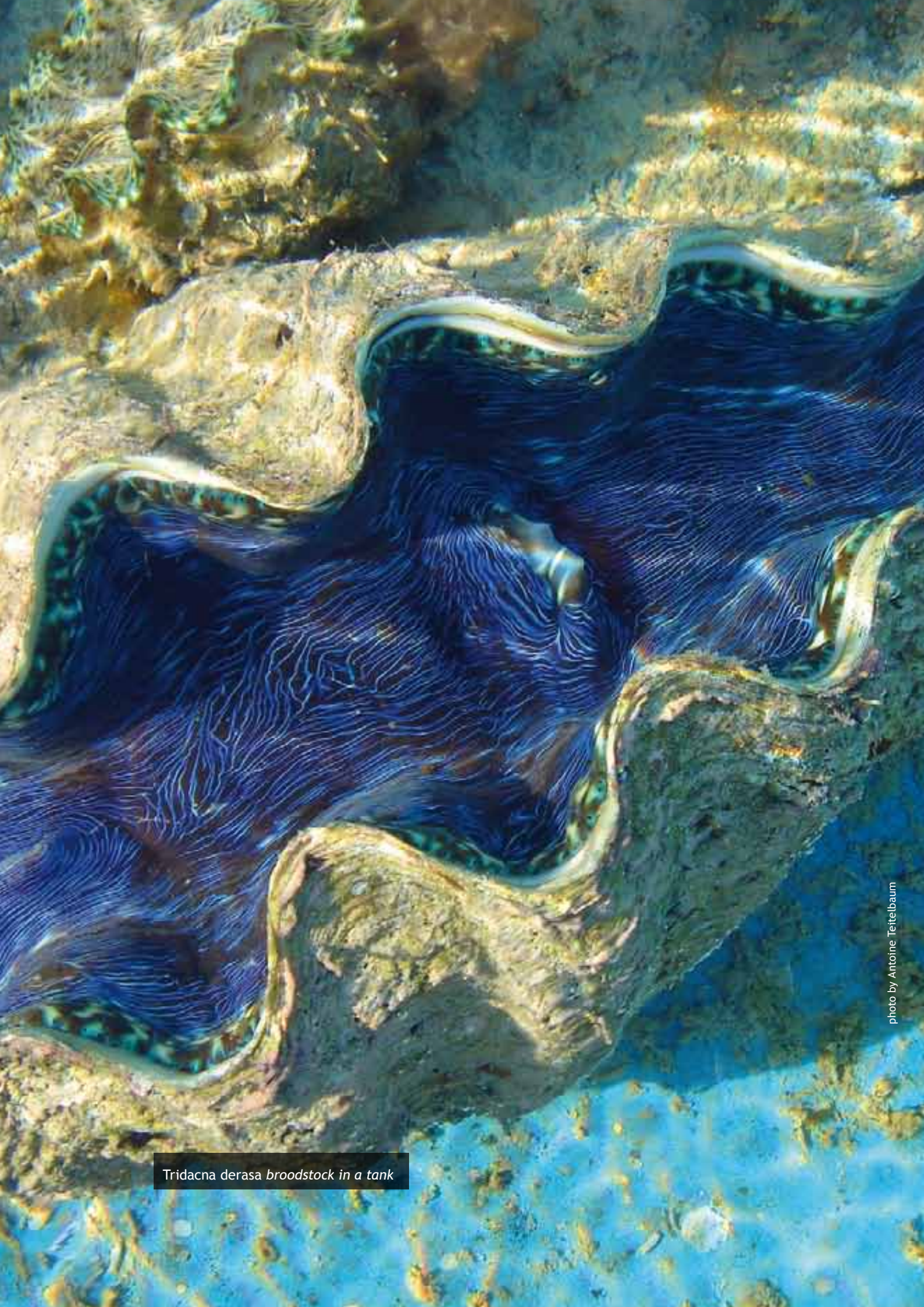
Tridacna derasa broodstock in a tank