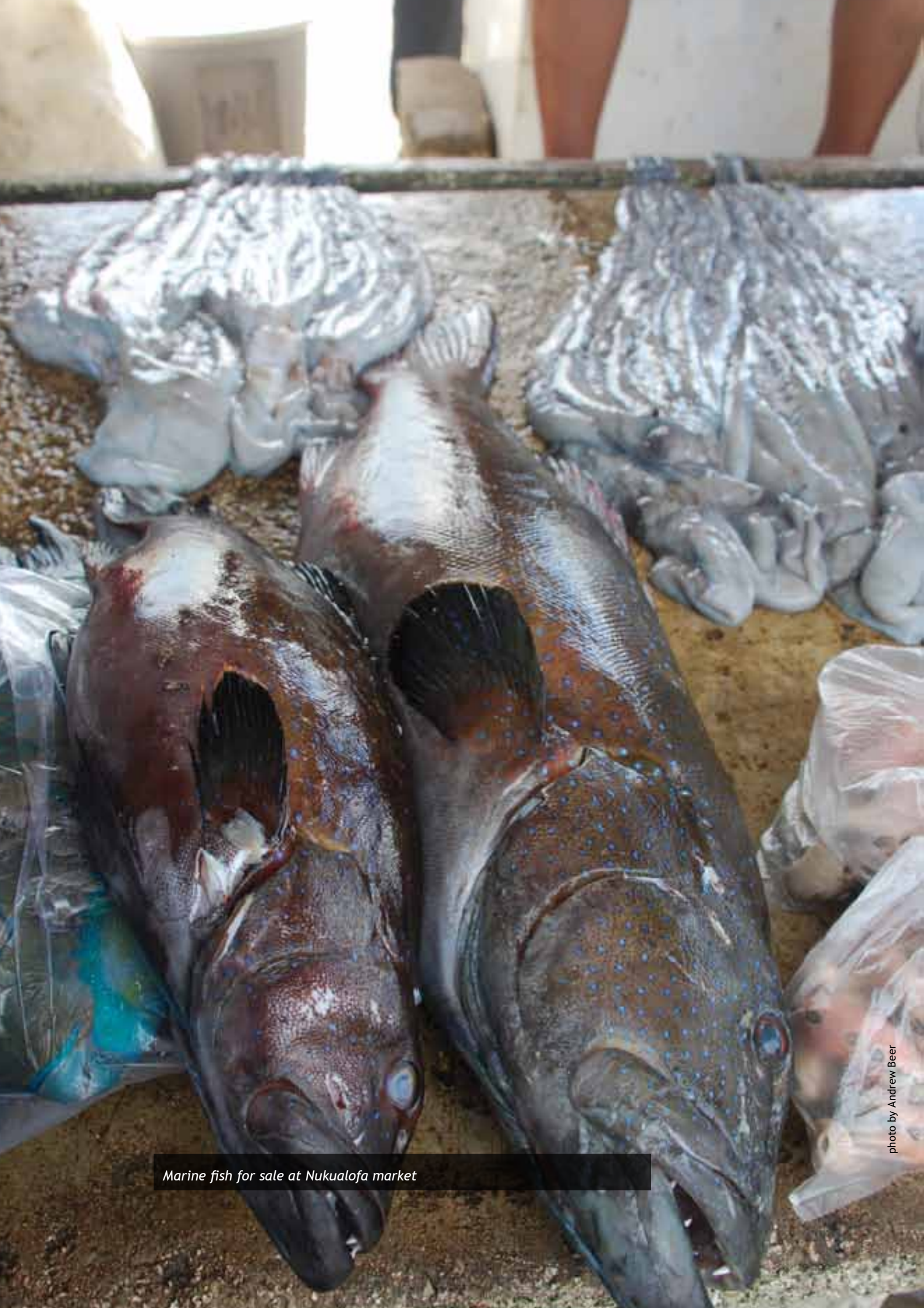
Marine fish for sale at Nukualofa market