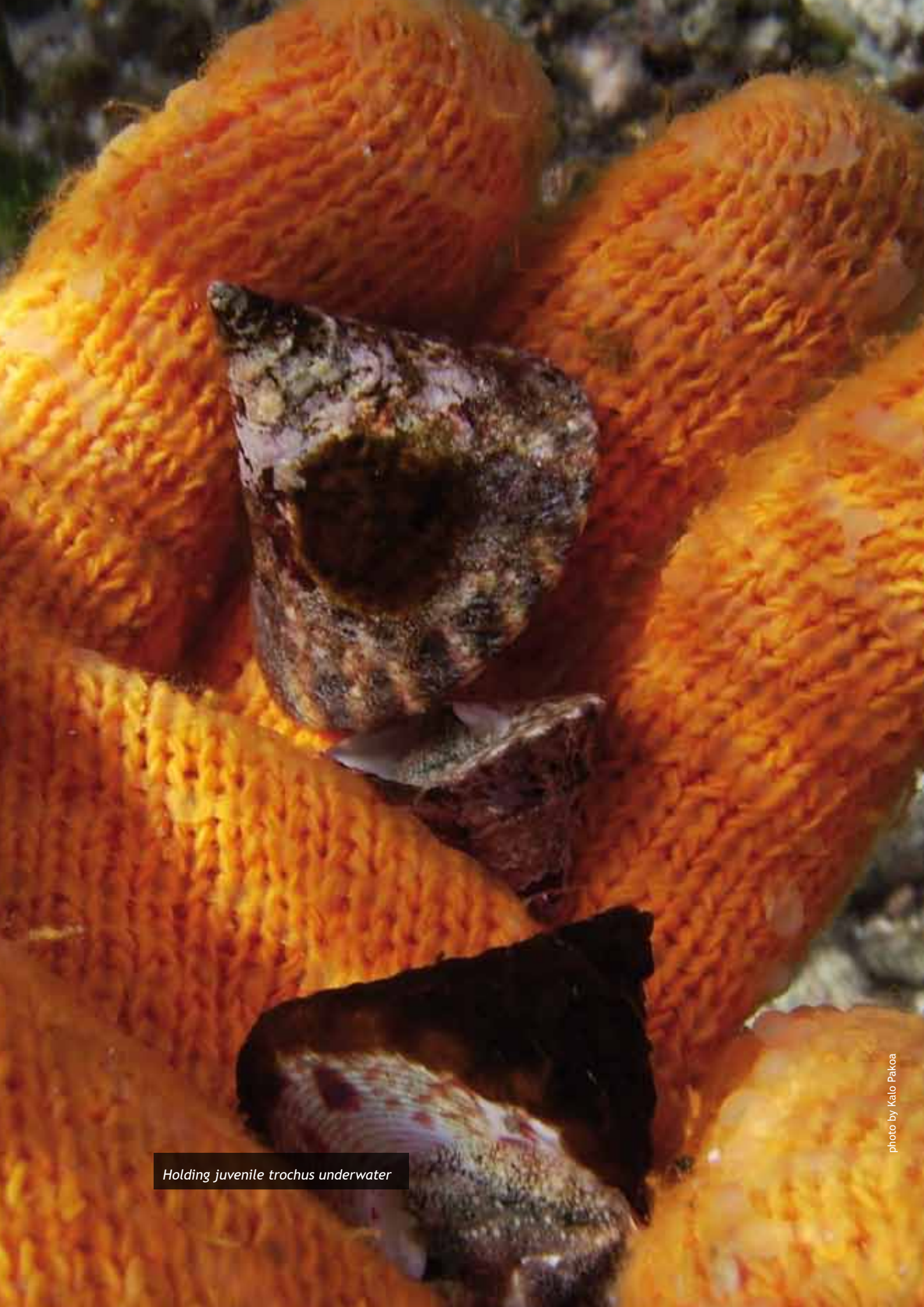
Holding juvenile trochus underwater