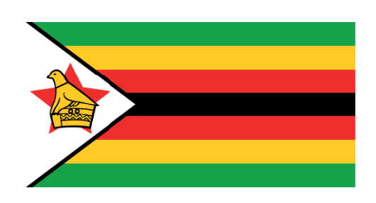
PART 2 NATIONAL ANTHEM (ENGLISH)